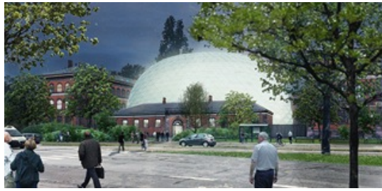
New Natural History Museum – Copenhagen