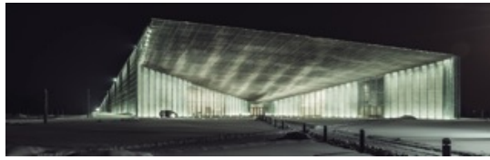
Estonian National Museum – Tartu.

Besides, the end of this November will be marked by the inauguration of the Design Museum in London in its new precincts, the renovated former Commonwealth headquarters building near Holland Park. How can this continuing blooming of museums , visible now in Europe for several decades can be explained? Why are so many Europeans cities and towns thriving to possess a unique cultural structure that will let them become a bright spot on the European cultural map?