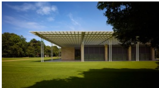
Museum Voorlinden, Wassenaar

essential for cities to project an attractive image. There is a global competition going on, pressing cities to possess their own cultural gem, no matter how much it will cost. This phenomenon is certainly not exclusive to Europe but is probably best seen at present on this continent. 20 years after the opening of the Guggenheim Museum in Bilbao, the wish to get a similar success still fuels several local and regional governments, beside the fact that less visible, networking initiatives of smaller structures also allow cities to get a rich cultural ecosystem that can become attractive for foreign audiences. Are these initiatives able to create a rich and vibrant cultural scene or are they just meant to attract tourists? To what extent can this model continue to be replicated? This article is only dealing with museums set in major urban centres, making no mention of those settled in smaller urban areas. For these smaller cities, funding is much smaller although they are still in need to serve local communities. These projects show how some “want it all and want it now”. The only thing they cannot afford (or want to afford) is the time needed to develop or consolidate a sustainable network of cultural institutions relying on local initiatives that would in the long-term help build the city’s reputation.