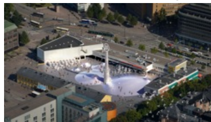
Amos Andersen Art Museum – Helsinki

It seems now that, for those who can afford it, hosting a temporary exhibition is not enough. When some of the most prestigious institutions in the world have a collection that can fill entire buildings, it is now almost natural for them to search for another home abroad matching the expectations of several cities to shine bright on the cultural map. In a very urban continent like Europe, where tourism has become an industry creating a harsh competition between cities to draw visitors , it is