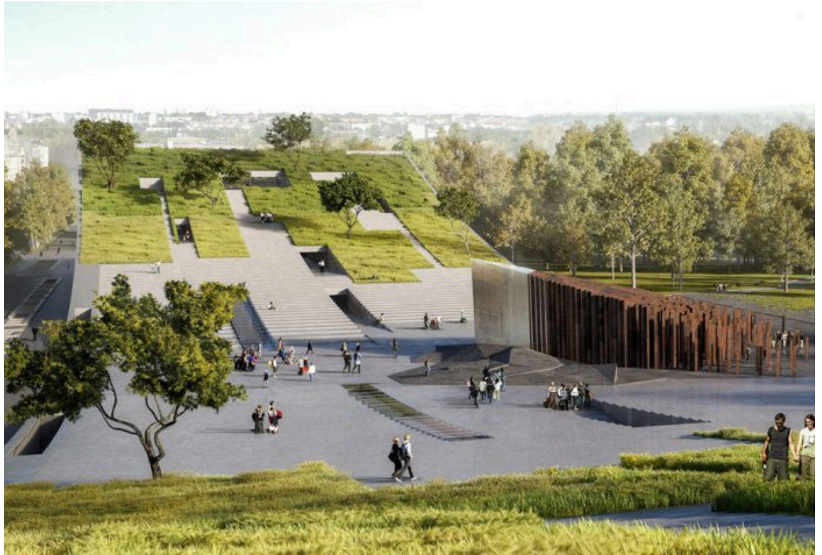
Museum of Ethnography Budapest

mid-2018, the completion of a National Museum Restoration and Storage Centre, and the restoration of the Museum of Science, Technology and Transport. This will also bring back to the building lying on the north edge of the city park, its pre-World War II condition and its original splendour. The second mile stone of the project is to provide the park with 3 new buildings designed to welcome new museums delivered in 2019: a new National Gallery to showcase Hungarian and International art from early 19th century to the present day, designed by Japanese architecture firm SANAA; a brand new House of Hungarian Music, designed by Japanese architect Sou Fujimoto with the Cité de la Musique in Paris and the Haus der Musik in Vienna as its models. The last building to be completed, lying on the South-western corner of the city park, will be the new Museum of Ethnography, created by Hungarian firm Napur Architect. What is striking with these 3 examples is the ambition and efforts shown by the 3 cities to cast the local museum scene in 21 st century , creating a somehow brutal rupture with the past.