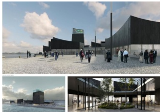
Guggenheim Helsinki