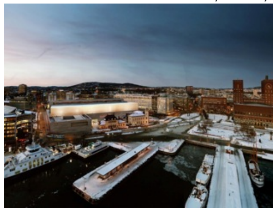
Nasjonalmuseet – Oslo