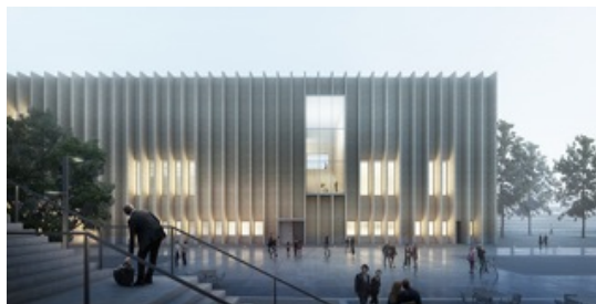
Plateforme10 – Lausanne.

Some other projects show an even more ambitious context and also rely, along the cultural project, on the will to give the city the opportunity to cast urban environment regeneration projects for entire zones. This is currently what is at stake with the future museums hub projects under construction in Lausanne (Switzerland), Oslo (Norway) and Budapest (Hungary). Bearing in mind the gathering of several world class institutions in one specific area, like the Museuminsel in Berlin, the Museumplein in