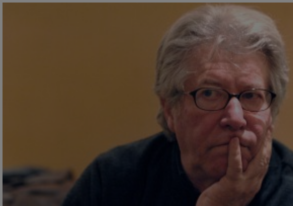
Androulla Vassiliou, European Commissioner for Education,

Culture, Multilingualism and Youth paid tribute to French film director Claude Miller who died in Paris on 4th April this year. He was aged 70. He was the President of the Europa Cinemas network, founded in 1992 with funding from the EU MEDIA programme, which promotes the screening of European films.