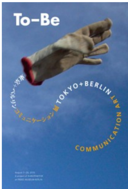
Tokyo+Berlin (To-Be), a multi-