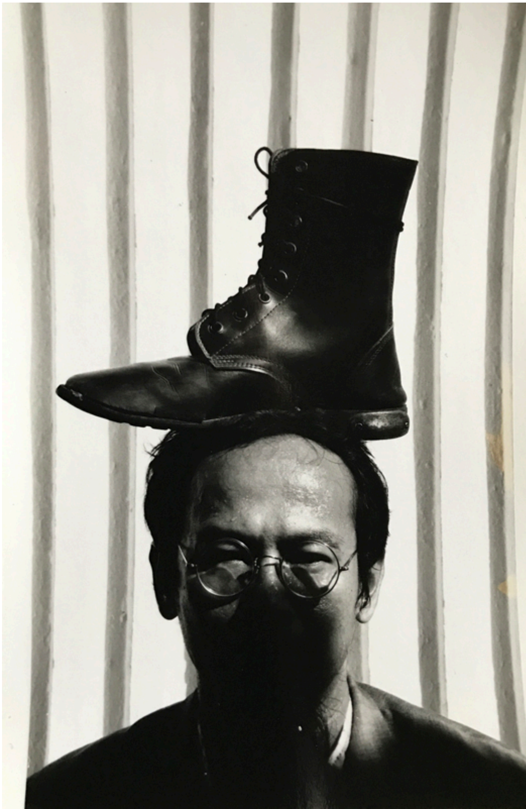
Awakenings: Art in Society in Asia 1960s - 1990s. As the culmination of a 5-year joint project by three national museums in Japan, Korea and Singapore, and the Japan Foundation Asia Center, the exhibition opens at the National Museum of Modern Art in Tokyo (MOMAT) from October 10 - December 24, 2018. The exhibition then travels to Korea and Singapore in 2018 and 2019.