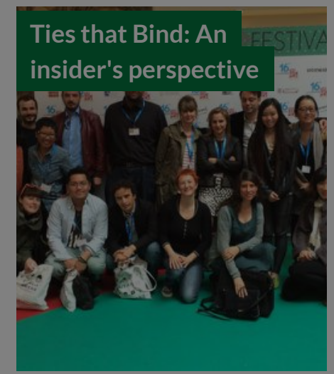
POSTED ON 06 JAN 2019

TIES THAT BIND 2019 - Asia / Europe Film & TV Co-production Workshop Call