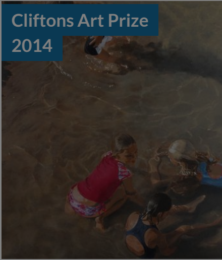
Cliftons Art Prize 2014