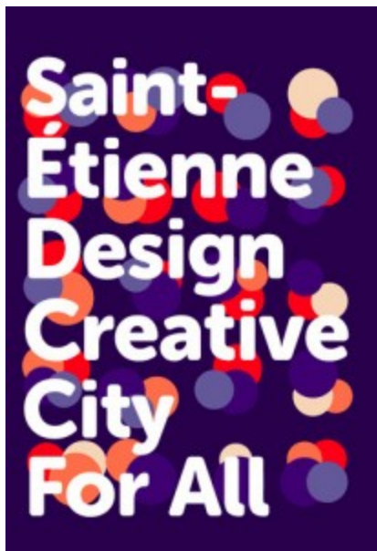
The exhibition "Saint-Etienne, Design