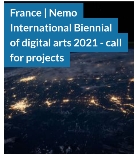
France | Nemo International Biennial of digital arts 2021 - call for projects