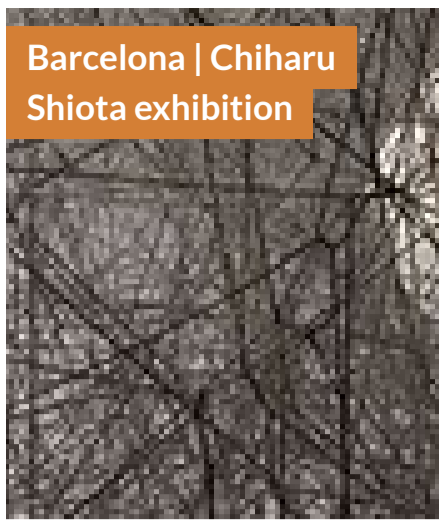
Barcelona | Chiharu Shiota exhibition