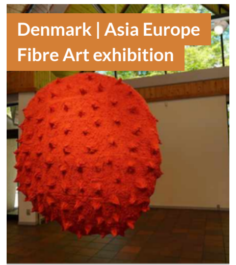
Denmark | Asia Europe Fibre Art exhibition