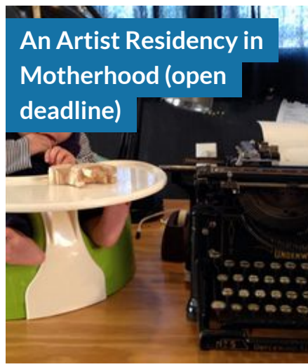
An Artist Residency in Motherhood (open deadline)