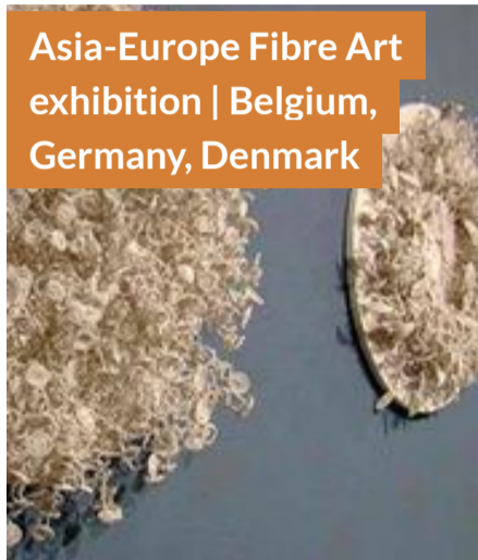
Asia-Europe Fibre Art exhibition | Belgium, Germany, Denmark