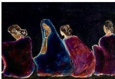
Coloured ink on paper, c.1929-30, Coll. Rabindra Bhavana

The year 2011 marks the 150th anniversary of the birth of Rabindranath Tagore (1861-1941), who is best known as a poet and the first non-European writer to be awarded the Nobel Prize for Literature in 1913. Various cultural institutions around the world have organised or will be organising programmes to celebrate this. In December, the Victoria and Albert Museum will showcase a display of about 50 Tagore's paintings from 1928 to 1939, which have never been displayed outside India.