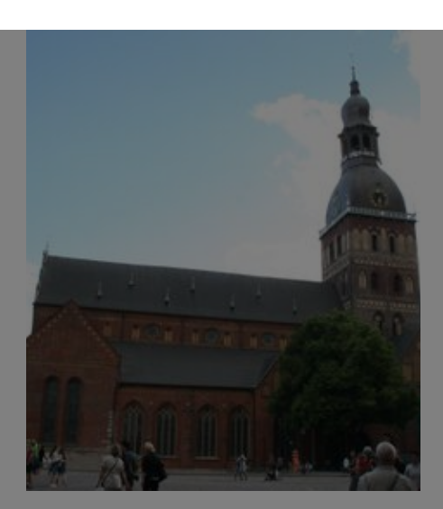
POSTED ON 01 JUN 2018