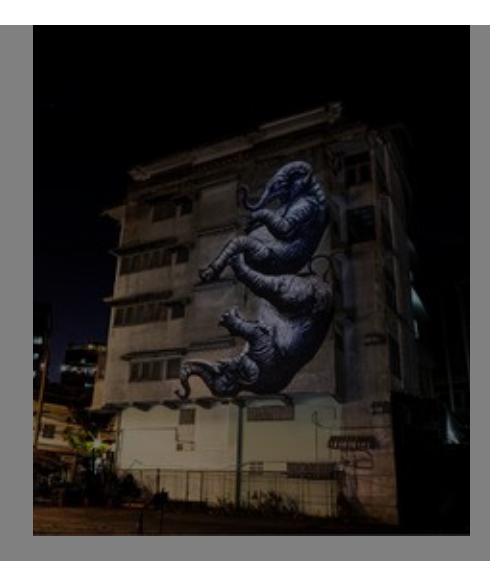
POSTED ON 25 JAN 2018