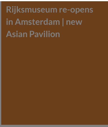
Rijksmuseum re-opens in Amsterdam | new Asian Pavilion