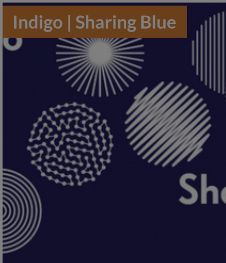
Indigo | Sharing Blue