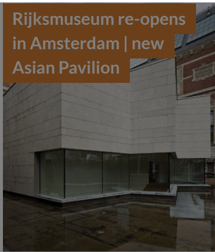
Rijksmuseum re-opens in Amsterdam | new Asian Pavilion