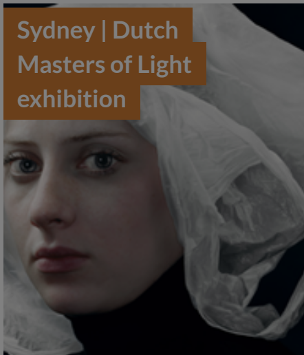
Sydney | Dutch Masters of Light exhibition