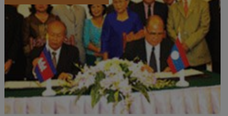
Minister of Information and Culture, Mounkeo Boune, (right) and Cambodian Minister of Culture Arts, Him Chhem