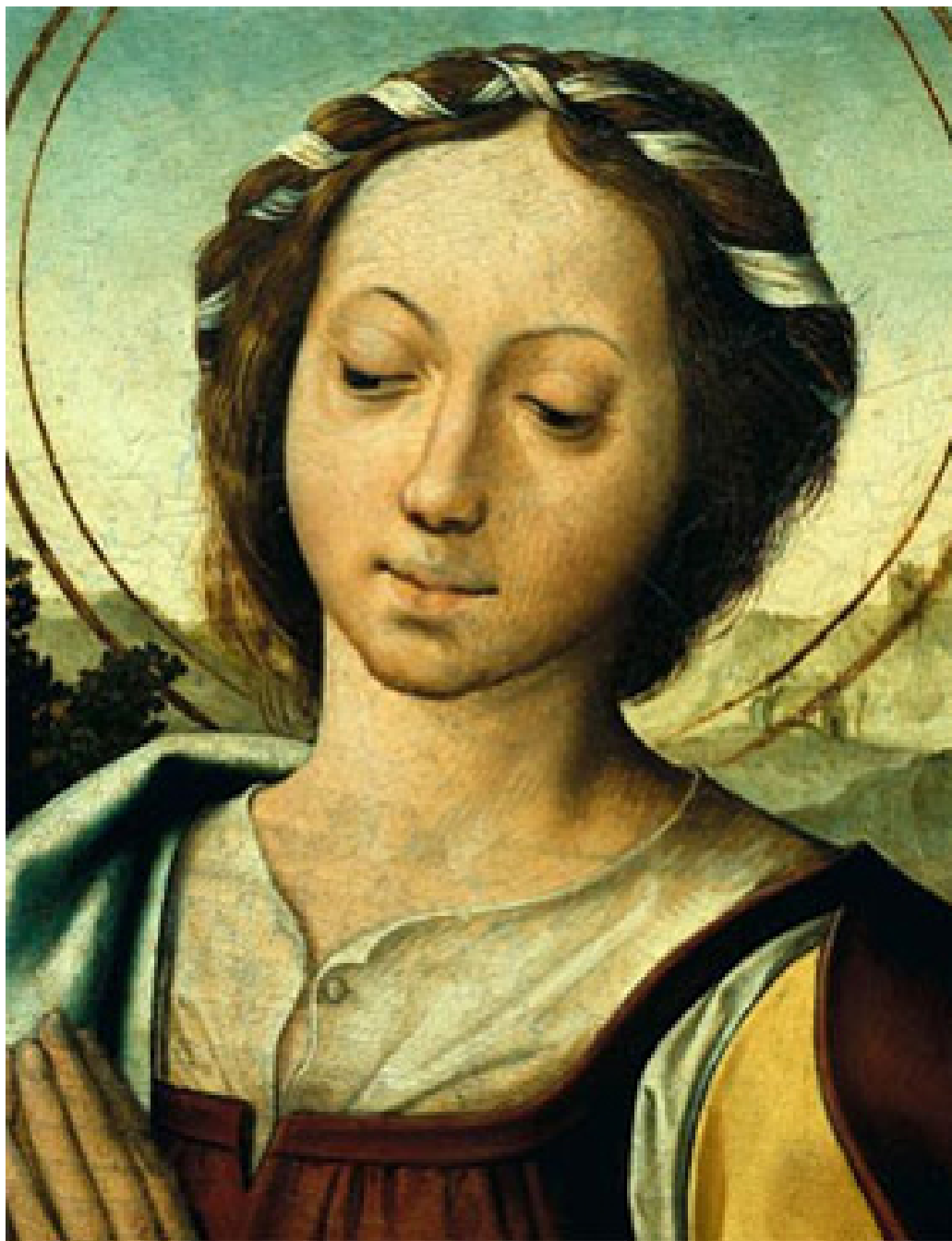
[caption id="attachment_12031" align="alignright" width="282" caption="Pentecost, predella of St. Margaret, head detail 16th Century