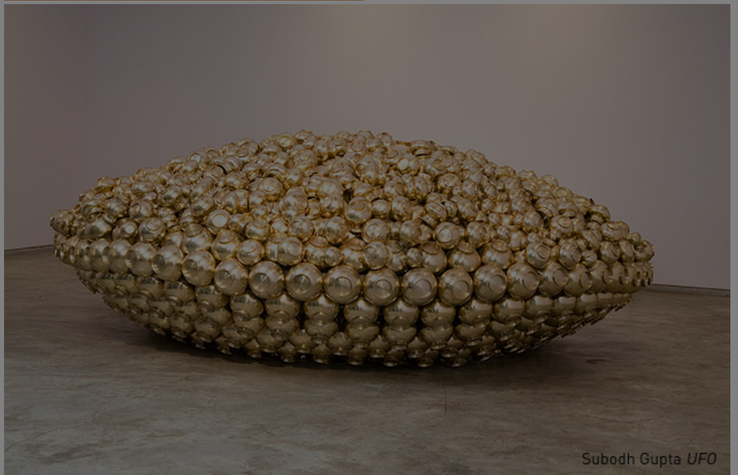
Subodh Gupta UFO

[caption id="attachment_7650" align="alignright" width="403" caption="Subodh Gupta, UFO"] [/caption] La Route de la Soie (The Silk Road) is a major exhibition of contemporary art from the collection of the Saatchi Gallery, presented in Lille, France at Le Tri Postal, featuring artists from China, India and Pakistan. For the first time in France , lille3000 presents more than 60 works from the contemporary art collection of the London based Saatchi Gallery, assembled for the exhibition entitled “La Route de la Soie” [The Silk Road]. A reference to the ancient trade routes between Asia and Europe which linked in particular China and the Middle East via India from the 2nd century before Christ... Three regions whose contemporary works of art arouse every day increasing interest in the international art world. The exhibition offers an extensive view of this recent artistic work through paintings, sculptures, photographs and installations of Chinese, Indian, Iranian, Palestinian, Lebanese, Egyptian, Afghan and Pakistani artists.