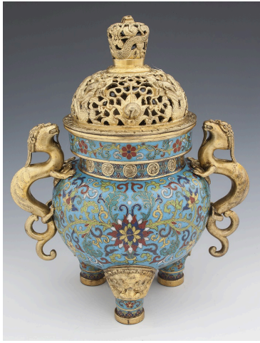
Persian decorative art dating back to the

Sasanian Dynasty (224-651). Qing Dynasty Ceramics constitute a world extremely rich in innovation and technological ingenuity, fascinating monochrome and flamed glazes as well as decorative forms of white vessels. This state of affairs was significantly influenced by the emperors – connoisseurs, patrons and art experts – such as Kangxi (1654-1722) and Qianlong (1736-1795). Painting – one of the most valued arts in China – is the element that binds the journey in time and space. The selected paintings are presented both in the classical form of hanging scrolls and as less common horizontal compositions. A special section at the exhibition is dedicated to clothing and accessories. Visitors have the opportunity to come across a unique and intriguingly saturated palette of colours. While admiring the variety of robe forms and styles, ornaments and embroidery, they will also find references to the ethnic complexity, customs, and finally – to the tastes of the Chinese society in the Qing Dynasty. In the Realm of the Dragon, one can encounter a great variety of themes which contribute to the creation of a coherent story about one of the oldest cultures in the world, presenting its aesthetics, tradition and symbolism. For additional information, please visit: