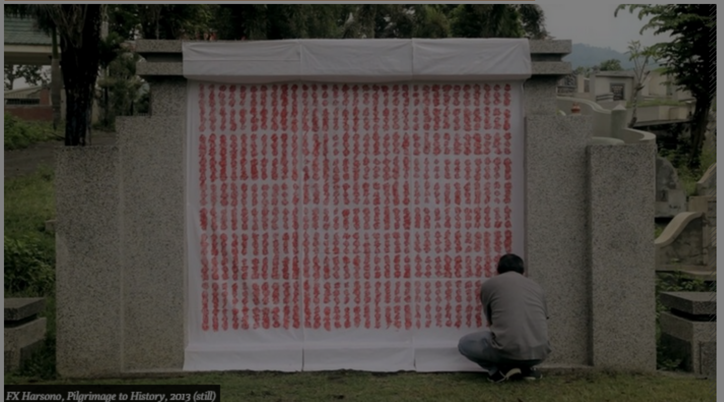
FX Harsono, Pilgrimage to History , 2013 (still)