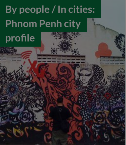
POSTED ON 04 SEP 2015