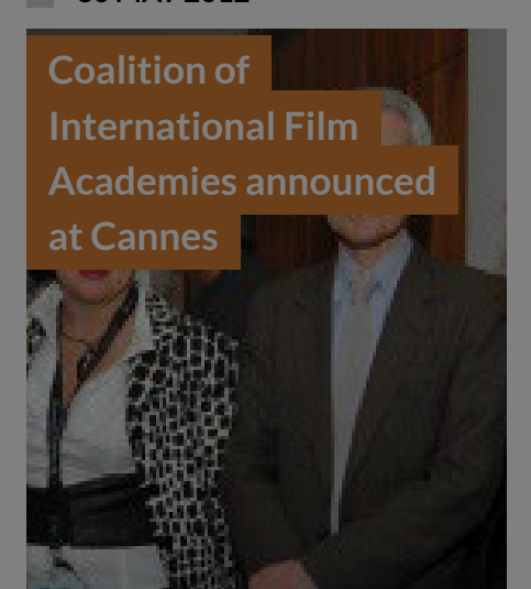
POSTED ON 12 OCT 2022