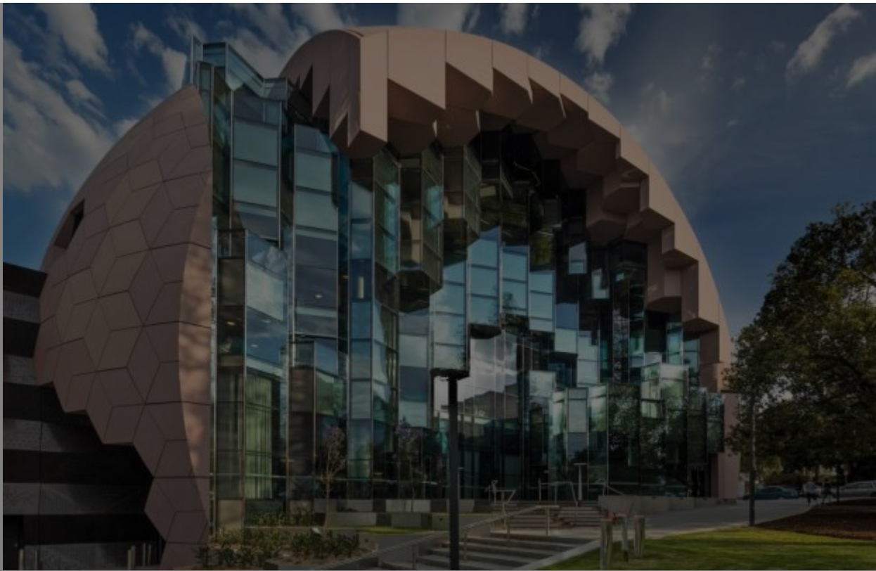
Geelong Library and Heritage Centre, Australia[/caption]

The prize is awarded by the Danish Agency for Culture and Palaces as a part of the Model Programme for Public Libraries with IT company Systematic as sponsor. Therefore the award is named 'Systematic – Public Library of the Year Award'.