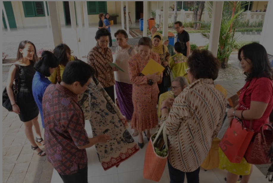
Picture: Batik experts and Batik lovers during sharing session over break time

"We were excited to share the passion on our Batik collection in Indonesia. At the same time, we felt very nervous because Batik is an integral part of Indonesia's cultural heritage and people's everyday life."