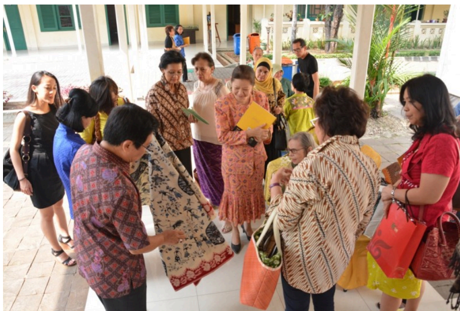
Picture: Batik experts and Batik lovers during sharing session over break time

"We were excited to share the passion on our Batik collection in Indonesia. At the same time, we felt very nervous because Batik is an integral part of Indonesia's cultural heritage and people's everyday life."