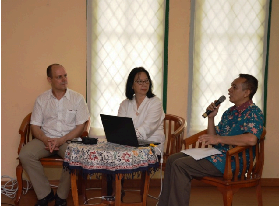
Picture: Presentation and discussion by curators from Museum der Kulturen Basel, Tekstil Museum Jakarta and Weltmuseum Wien

block form of printing was developed in Java using a cap.'