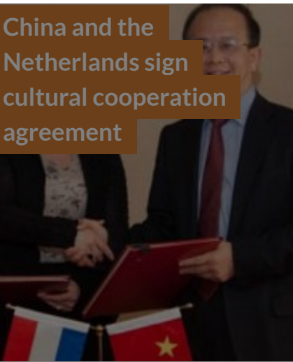
China and the Netherlands sign cultural cooperation agreement