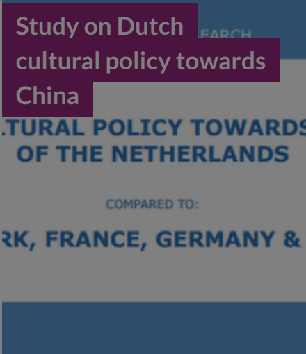
Study on Dutch cultural policy towards China