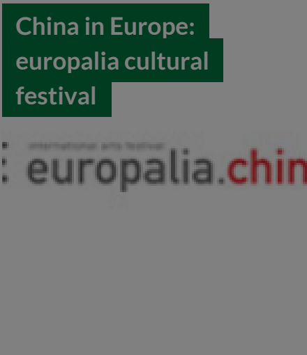
China in Europe: europalia cultural festival