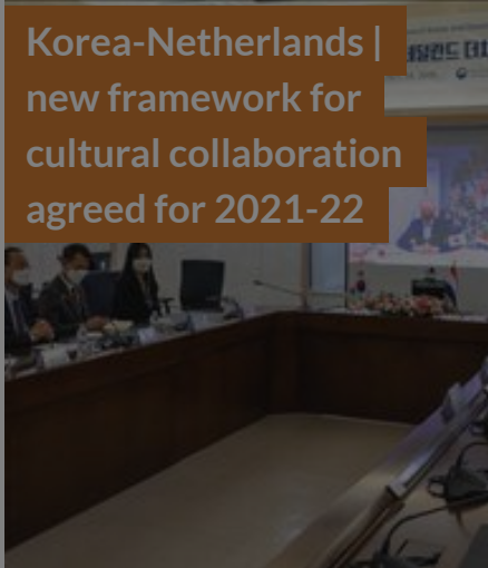
International Arts Joint Fund The Netherlands-South Korea (NL based applicants)