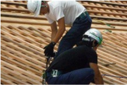
Japan's Agency for Cultural Affairs

(Bunkacho), the Asia-Pacific Cultural Centre for UNESCO (APCCU), the International Centre for the Study of the Preservation and Restoration of Cultural Property (ICCROM) and the National Research Institute for Cultural Properties, Japan, are organising a training course entitled "Preservation and Restoration of Wooden Structures" , which will be held in Nara, Japan, between 1 September and 1 October 2015. This course aims to provide participants with the latest methods and techniques for investigation, analysis, preservation, restoration and management of wooden structures. It is aimed at professionals from countries in Asia and the Pacific that have ratified the UNESCO World Heritage Convention. Travelling and living expenses for a majority of the 16 selected participants will be covered by the organisers. Specific objectives of the course on "Preservation and Restoration of Wooden Structures" include the following: