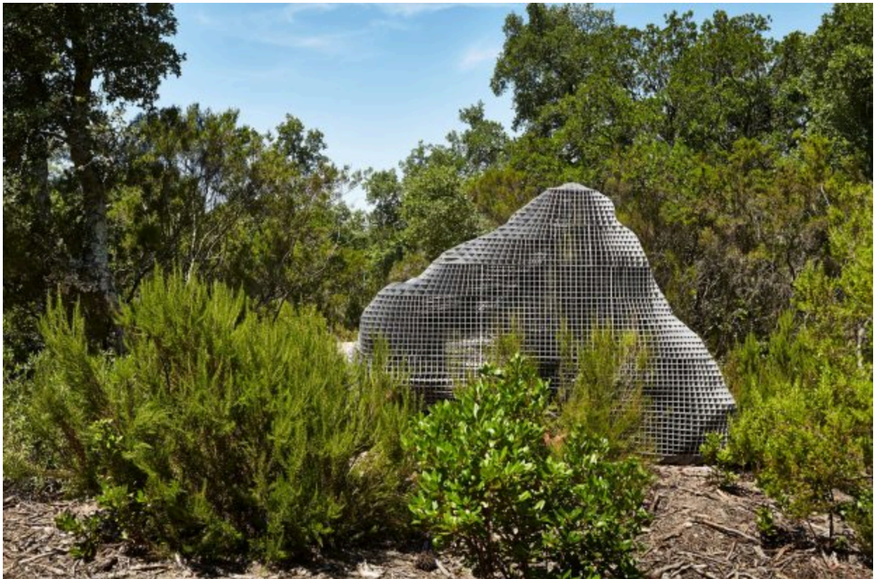
Sui Jianguo, Dream Stone, 2010, Stainless sandy steel, Edition of 3 ex