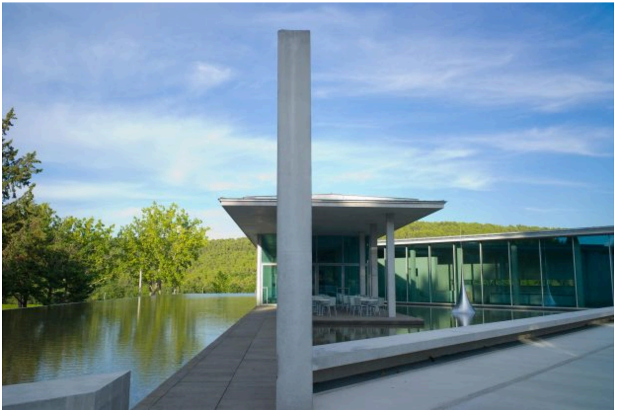
Tadao Ando, ART CENTRE 2011

Tadao Ando conceived the Art Centre for Château La Coste. The building adopts many of the Japanese master's signature elements to create an extraordinary experience of light and space in nature. A vast infinity pool of water hides an underground car park and provides a spectacular stage for an upper level that is laid out on a V-shaped plan. Château La Coste, in collaboration with Lisson Gallery and galerie kamel mennour, is delighted to present an exhibition of new and recent work by Lee Ufan (29 May - 24 September). Housed within a custom-built gallery space designed by French architect, Jean Michel Wilmotte, this is the second exhibition in