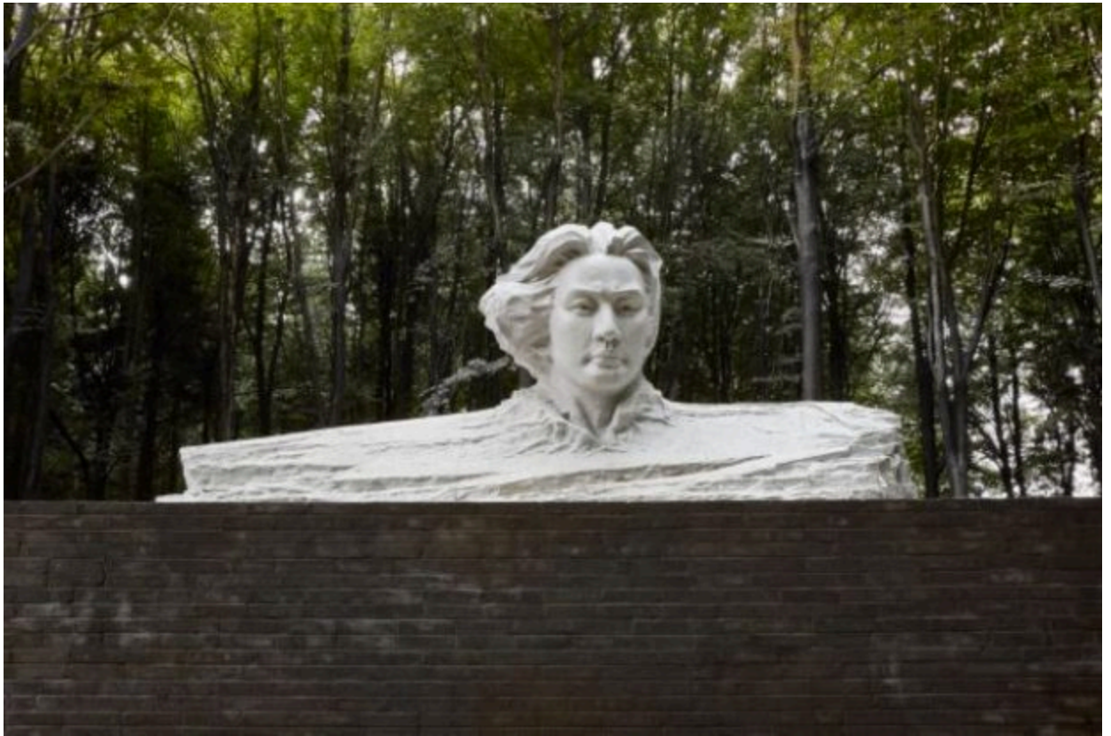
Song Ta, Why do they never take colour photos?, 2016

Cass Sculpture Foundation is delighted to present A Beautiful Disorder , the first major exhibition of newly commissioned outdoor sculpture by contemporary Greater Chinese artists to be shown in the UK.