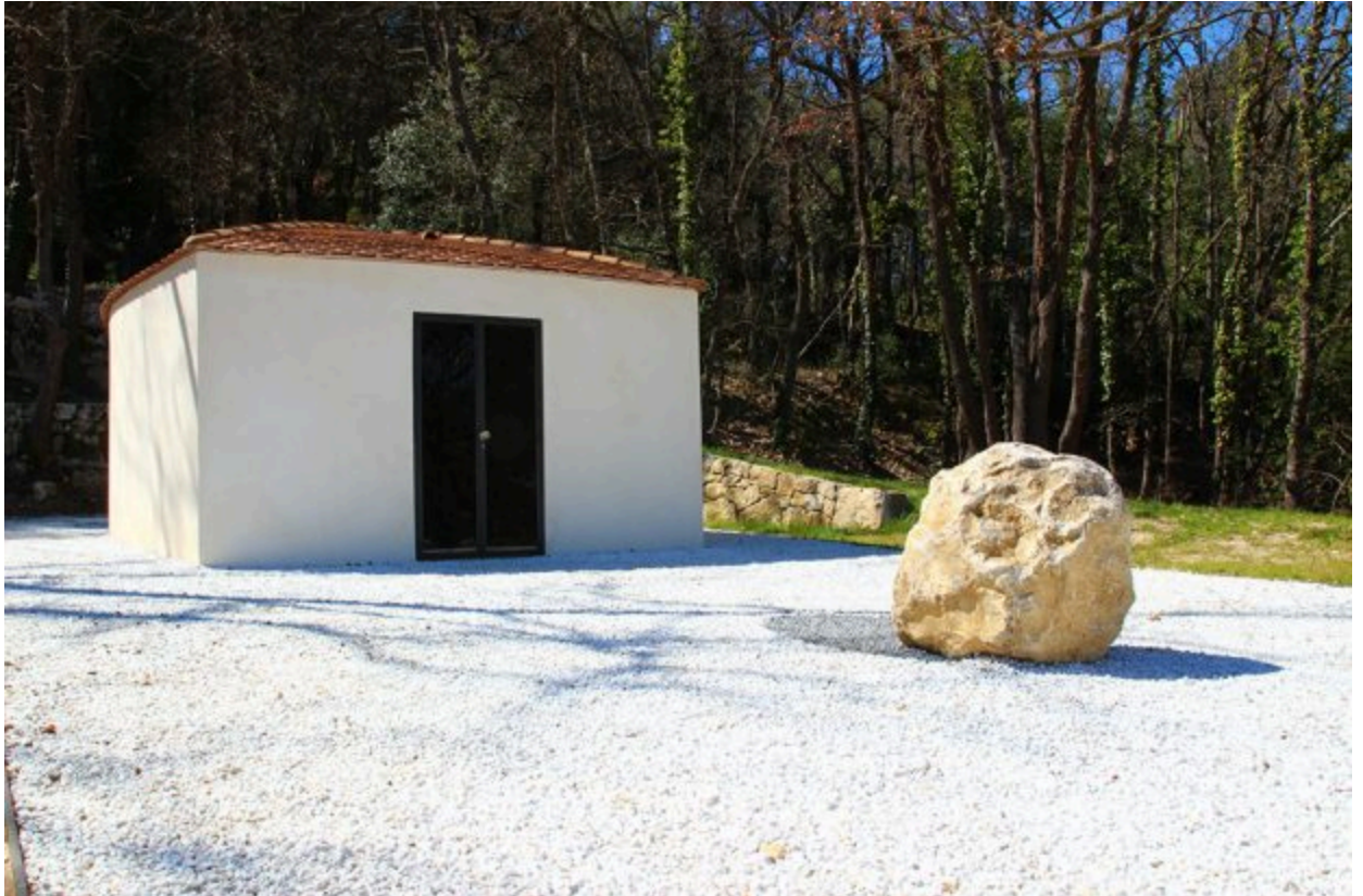
Lee Ufan, HOUSE OF AIR 2014

Lee Ufan's solo exhibition at Château La Coste, the Korean artist's first in France following his presentation at the Palace of Versailles in 2014, is in many ways an extension of "House of Air", a permanent commission unveiled at the château in 2014. You can go on an art and architecture work and view other artworks commissioned for the site.