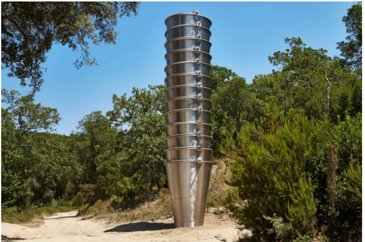
Subodh Gupta, A Giant Leap of Faith, 2006, Stainless steel, Edition of 3 ex