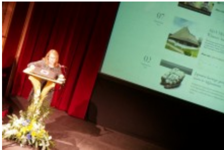
The presentation on the Museum of

network to the delegates. A number of attendees commented to me later. The network was previously unknown to them but they found it of interest. Several wondered whether their museums were already members, or were represented on the VCM website . As a number of other networks were present as supporters of The Best in Heritage, namely representatives from Europa Nostra and ICOM, there was a general appreciation for the relevance of ASEMUS . One museum representative had a particularly interesting proposal that I hope may bear fruit in the future. Q: Among the case studies and experiences presented during the conference, were there any that you found particularly remarkable? I found a number of the case studies moving, inspirational and remarkable. I will mention just two that struck me as significant.