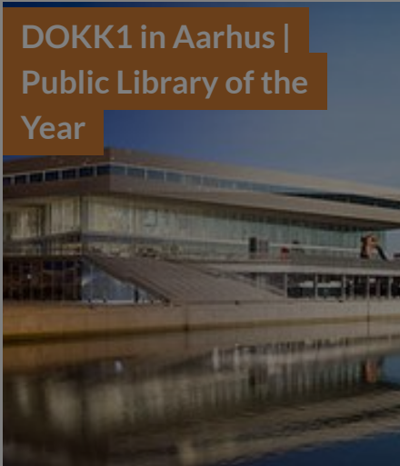
DOKK1 in Aarhus | Public Library of the Year