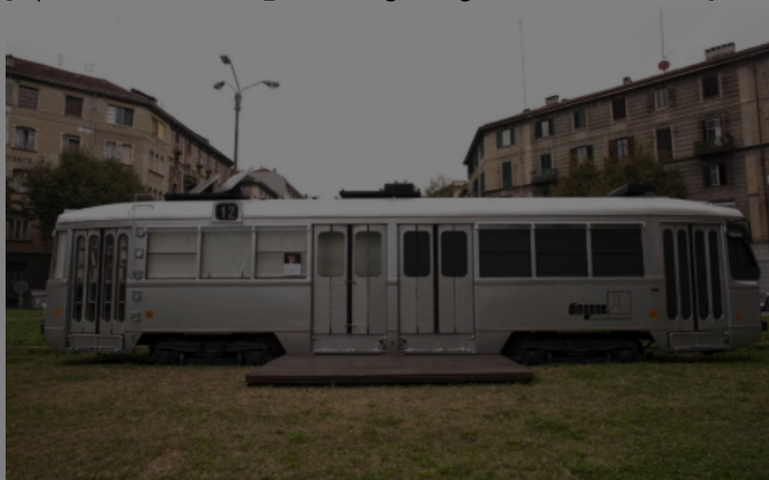
The Diogene tram.

[caption id="attachment_65460" align="aligncenter" width="553"]