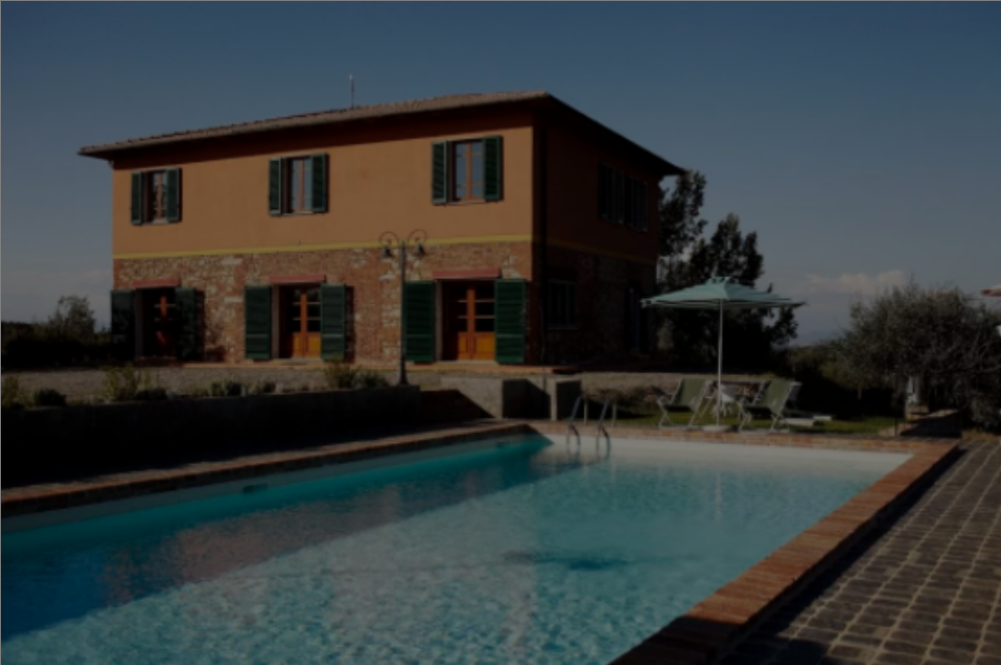
Villa Lena. Photo

[caption id="attachment_65463" align="aligncenter" width="551"]