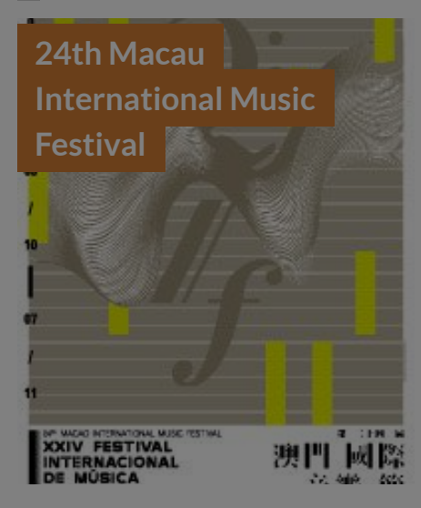
POSTED ON 01 DEC 2014