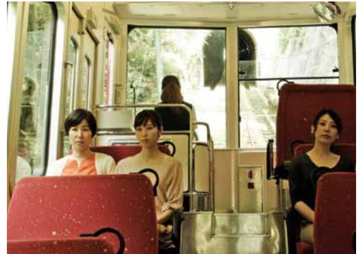
“Senses” - Ryusuke Hamaguchi