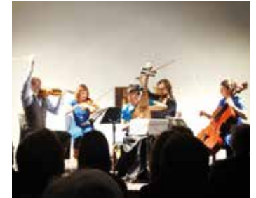
Sun*Sun*Sun String Orchestra