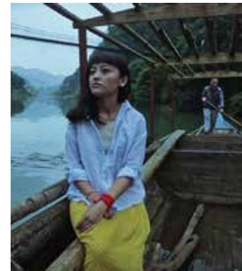
"Kaili Blues" - Bi Gan