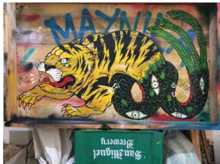
Faces At A Crossroad