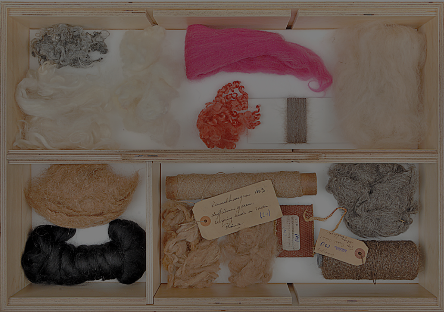
[caption id="attachment_60796" align="aligncenter" width="620"]