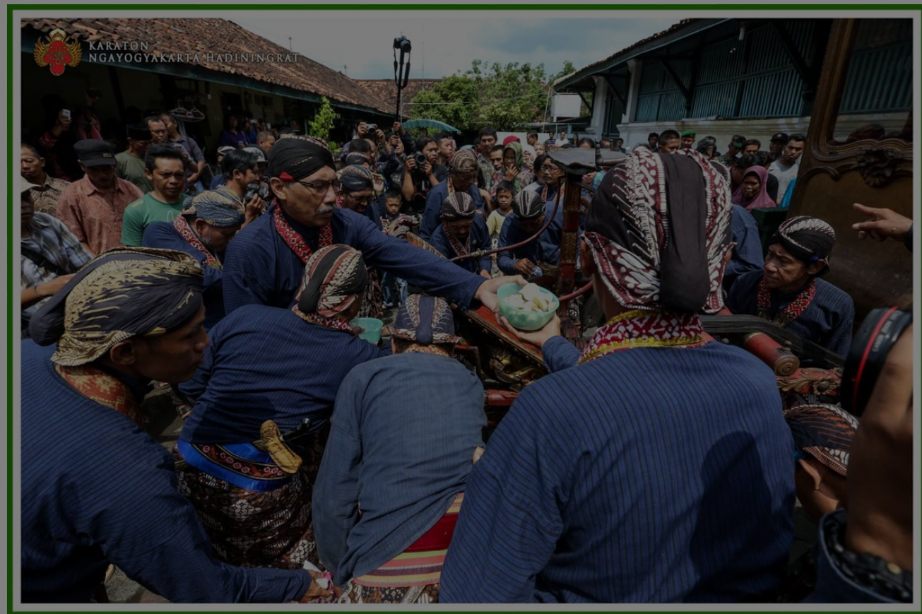
Kanjeng Nyai Jimat being prepared for Jamasan at the Royal Carriage Museum of Yogyakarta