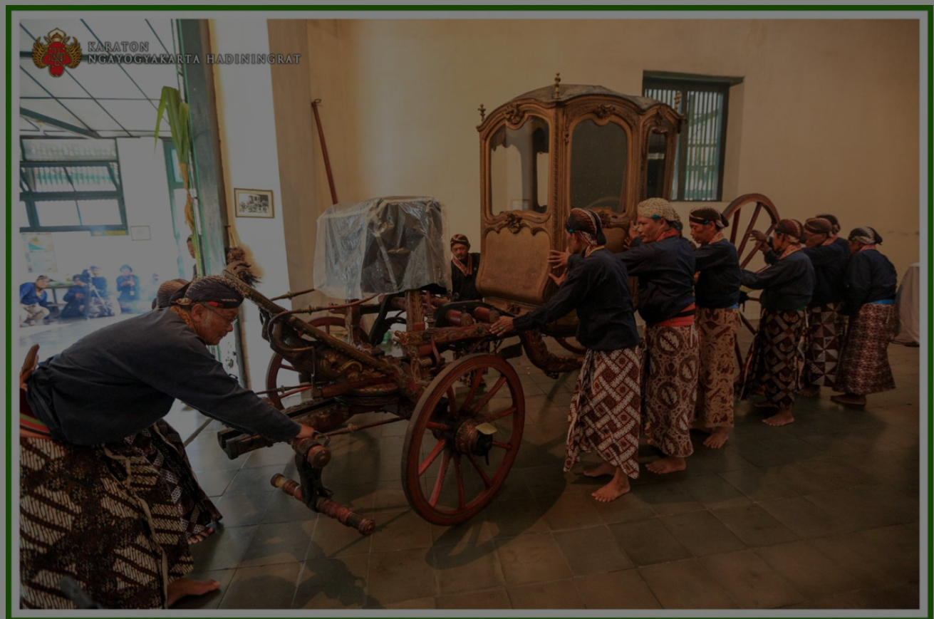
Offerings at the ritual for Canthik Kyai Rajamala at Radya Pustaka Museum