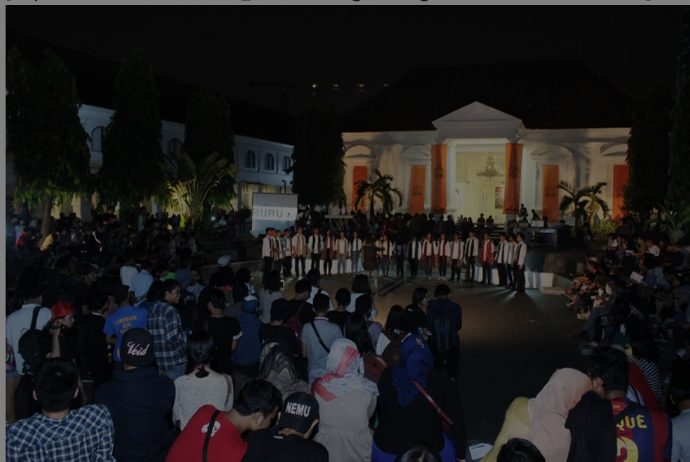
The crowd of the opening and

[caption id="attachment_52991" align="aligncenter" width="496"]