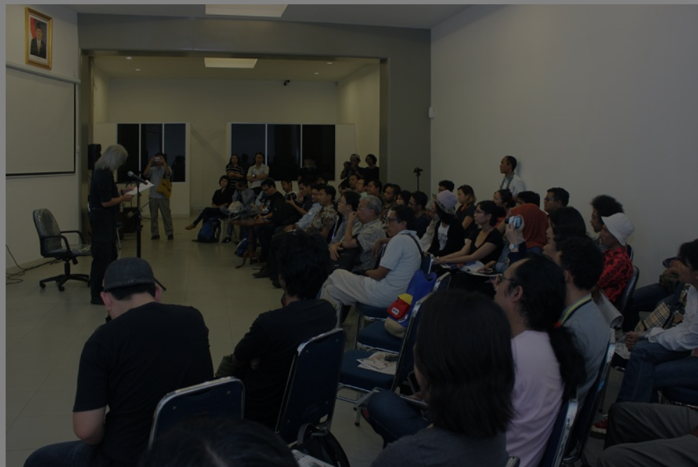
A Keynote speech from Seno

[caption id="attachment_52989" align="aligncenter" width="496"]