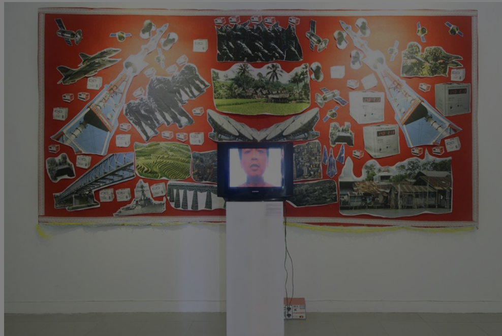
Stabilizer by Reza Asung