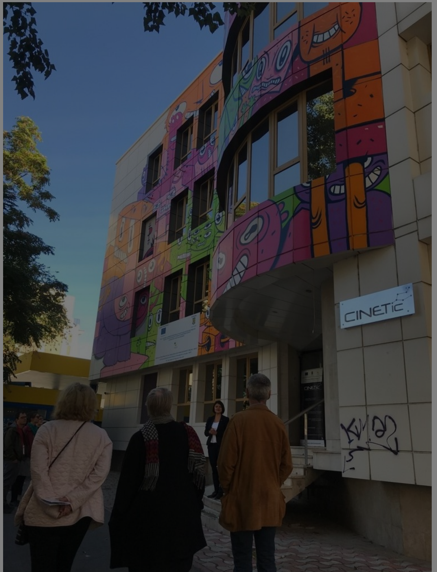
26th ENCATC Congress: The International Center for Research and Education in Innovative Creative Technologies (CINETic), technological innovation and research in the fields of digital interaction and applied neuroscience in the performing arts.

sustainability and maintaining cultural continuity amidst the rapidly changing cultural landscape. The three major activities that were provided to the participants in order to have an engaging and meaningful experience in the Congress were the following: firstly, ENCATC members were given a platform for exchange and dialogues during the general meetings and fora. Secondly, the young and emerging scholars were given an opportunity to present their current researches. Research trends, methodologies, various frameworks and perspectives, funding and publishing opportunities, possible linkages and tie-ups for collaborative researches were some of the highlights of this session. And lastly, the tours of selected cultural institutions such as The International Center for Research and Education in Innovative Creative Technologies – CINETic, The National Museum of Contemporary Arts, and Nod Makerspace. The visits to these institutions allowed the participants to take a peek at the current interests and endeavors of cultural workers, practitioners, educators, researchers, and designers in Bucharest, Romania.