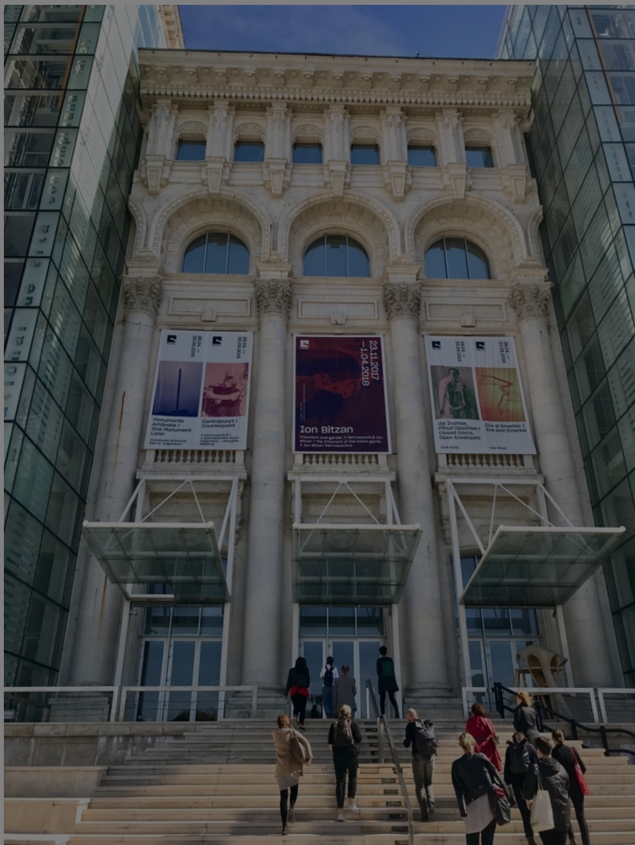
26th ENCATC Congress: National Museum of Contemporary Art of Romania