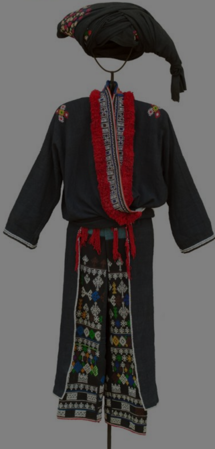
Yao Mien costume from TAEC