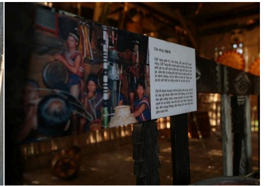
3. The community museum project