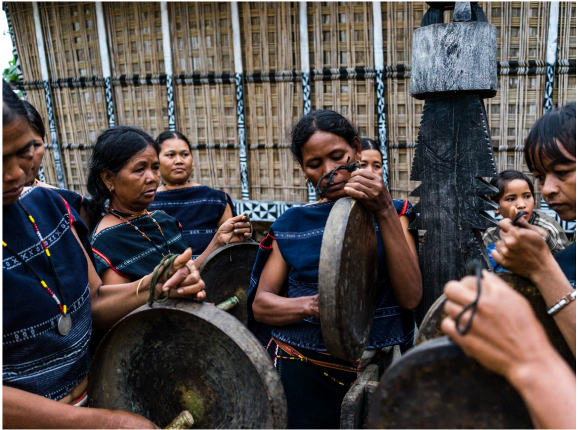
2. The Bahnar women playing gong at a local festival in Mo H'ra village

Over the two years, Viet Nam Institute for Culture and Arts studies worked with Mø H'ra villagers, led by their respected elders, to design and conduct training, which enabled people to recognise their valuable heritage assets and have appropriate behaviours and actions in protecting them. Village leaders organised a community meeting to discuss ways to maintain gong culture in their village, as well as to develop new livelihoods surrounding it. They agreed that heritage could help improve local development, which resulted in the building of a small museum, a space for honouring the gongs and other heritage and traditions of the community.