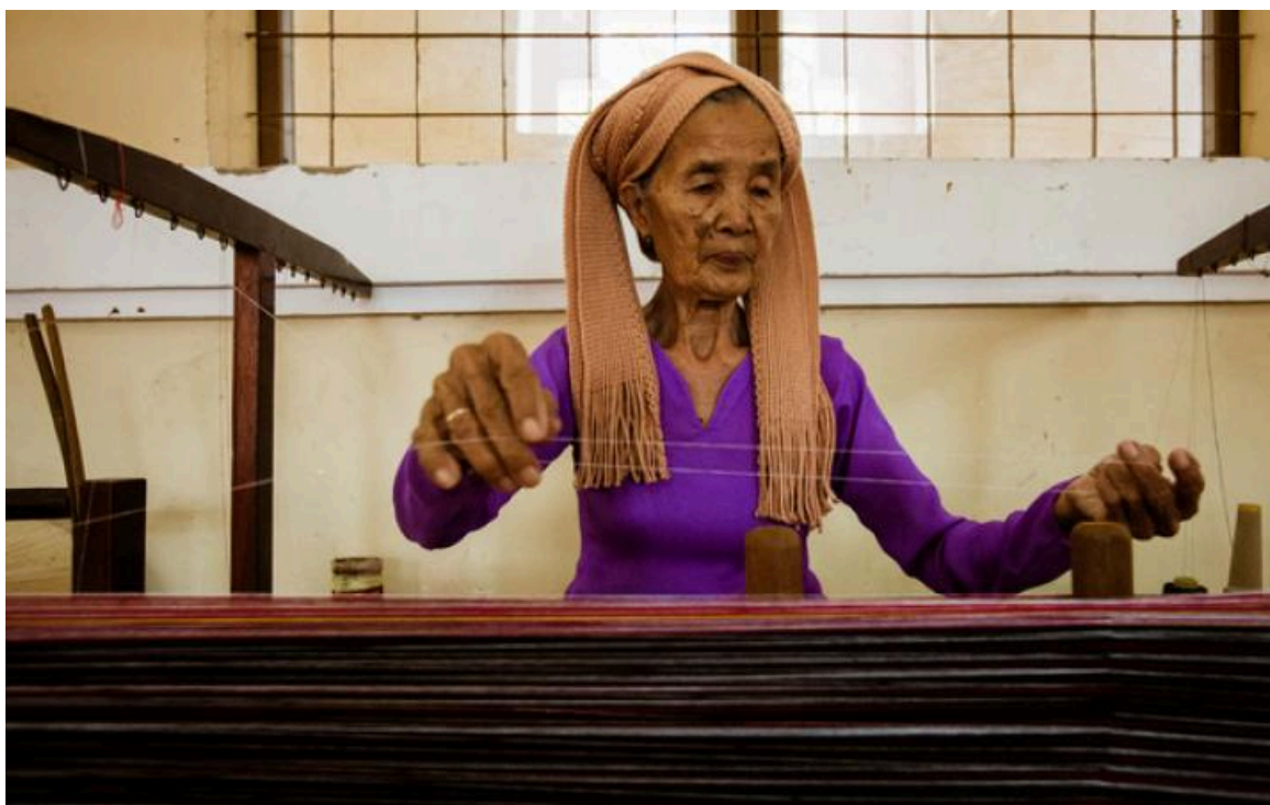
1. A senior artisan demonstrating skills while weaving traditional patterns on a long loom in Mỹ Nghiệp, Ninh Thuận province, March 2022

Music and film heritage – especially that of or representing marginalised groups, including ethnic minority groups located in remote, rural areas – are becoming increasingly less visible in Viet Nam’s contemporary culture and society, against the backdrop of overwhelming economic growth. Within this context, efforts in safeguarding valuable and at-risk intangible cultural components have received very little attention and support. The situation affects the capacity of communities surrounding said components to develop their human capital and contribute to the development of the country.