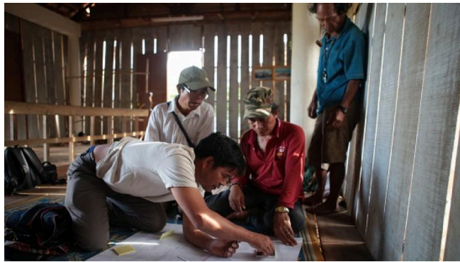
3. The community museum project