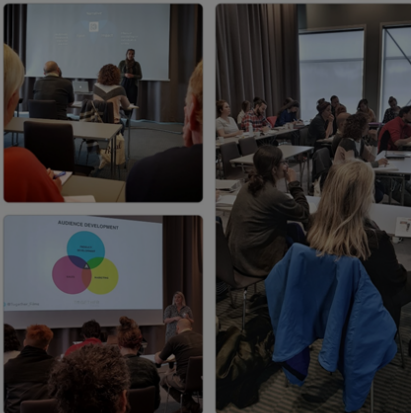
ESoDoc training in progress

To participate in ESoDoc, participants should be dynamic and should be ready for change – both in their attitude and mindset – in order to be a pro-active player able to bring original inputs to the group and to elaborate an innovative project in line with the new trends of the audiovisual industry.