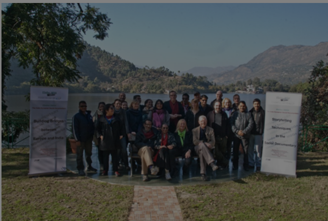
ESoDoc India 2010

An important part of ZeLIG's and therefore ESoDoc's mission is its creative focus on this multi-lingual, multi-cultural tradition. With this vision in mind, ZeLIG developed ESoDoc – European Social Documentary and various other training initiatives related to social themes, like LINCT in 2009, ESoDoc India in 2010 and ESoDoc International in 2011/2012.