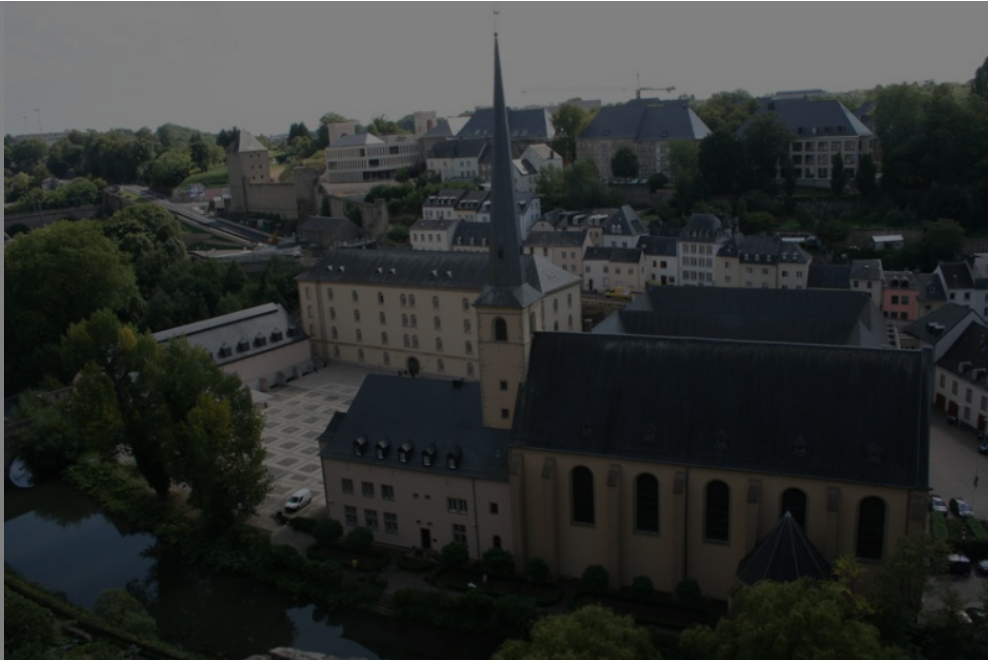
The Neumünster Abbey

Cultural Exchange Center (CCRN)[/caption]