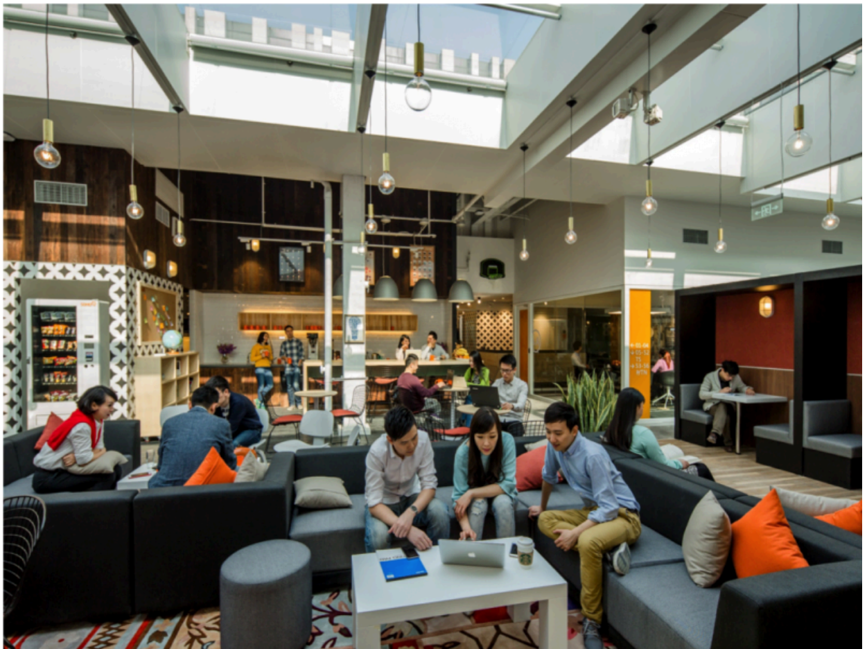
A co-working space in Shanghai. By Eterna S (Own work)[/caption]