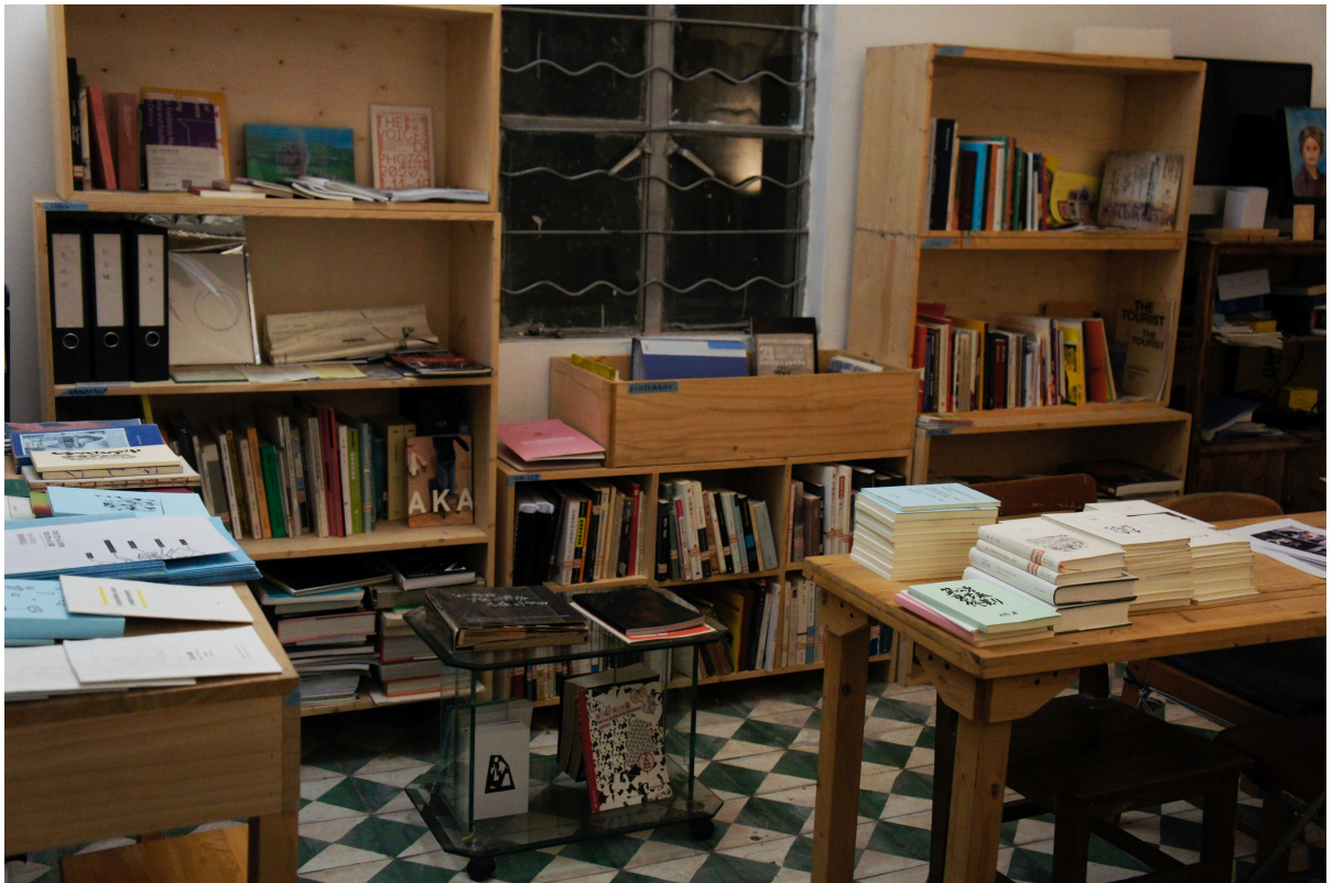
Inside the Reading Room.

During the COVID-19 pandemic, HB Station has suspended or postponed a series of activities, including exhibitions and its residency programme. Instead of rushing to launch online programmes, HB Station has undertaken to continue to host offline projects with improvised practices.