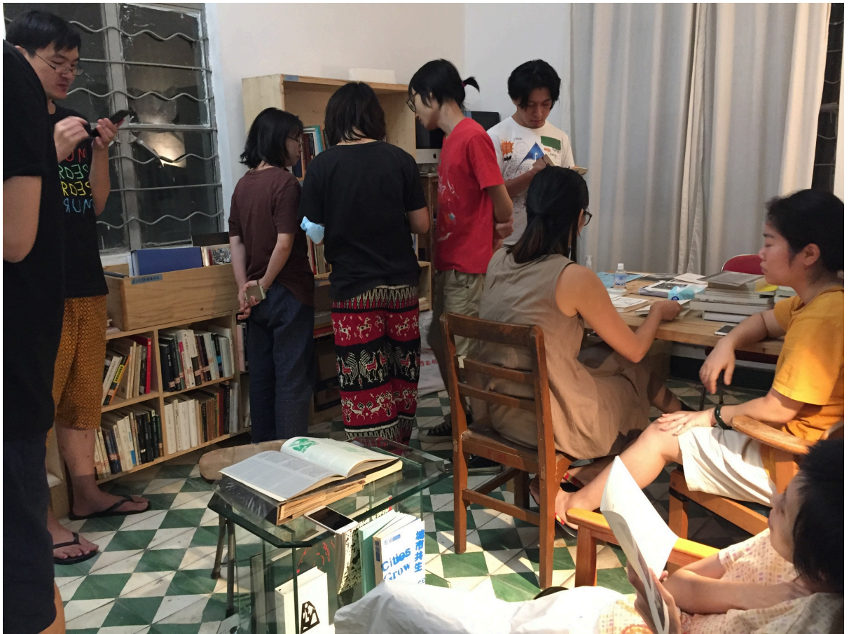
A late night visit to the Reading Room.

After almost a year of preparation, Reading Room opened to the public in October 2020, on an appointment-only basis. Nevertheless local friends can always find their way here. Once a group of friends came at night and stayed until late. We also used resources in the Reading Room as references for working with artist Chen Jialu in producing her publication. We plan to host more informal workshops to utilise the materials and space of Reading Room in the future.