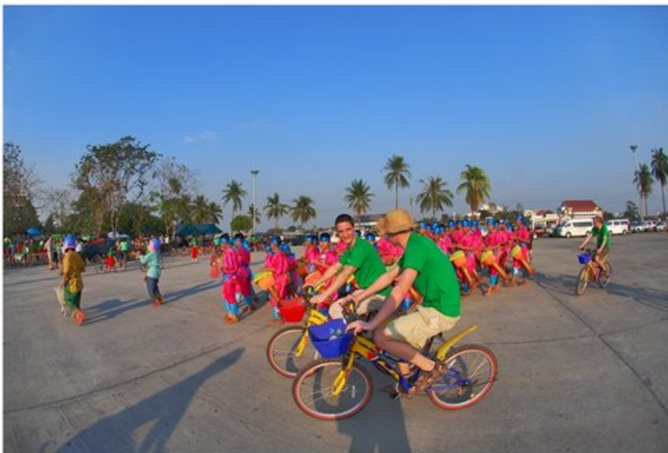
Patumthani International Theatre Festival

Imagine performances by rice fields, opening night parade in farm trucks through the neighbourhood, morning drills before sunrise ... Imagine artists performing for students from all over Thailand, and students performing for artists from all over the world... There, you arrive at Pathum Thani International Theatre Festival, in the province of Pathum Thani of Thailand.