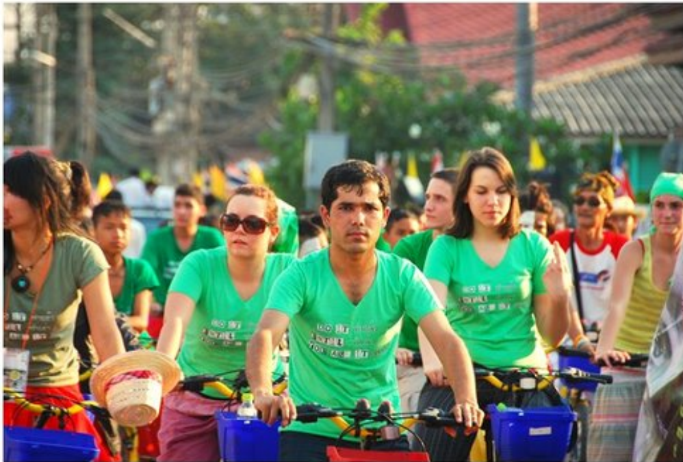
Patumthani International Theatre Festival