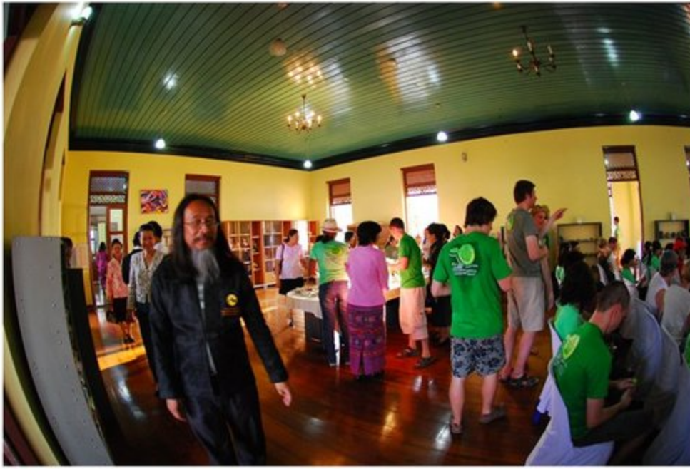
Patumthani International Theatre Festival

It was within these contexts that Pathum Thani International Theatre Festival came into being as a platform to bring together these three facets in Moradokmai's work and communities.