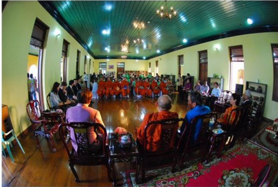
Patumthani International Theatre Festival