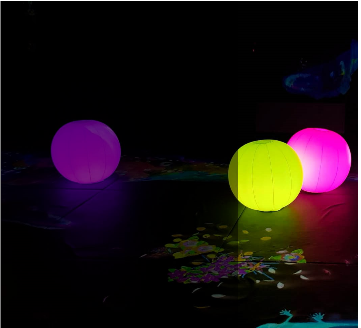
New technology and the arts

Digital Arts Museum is a good example for the new era of museums today. This is where art and technology collide and create a new experience aesthetically to visitors with no boundaries, leaping ahead of traditional display of art objects with captions.