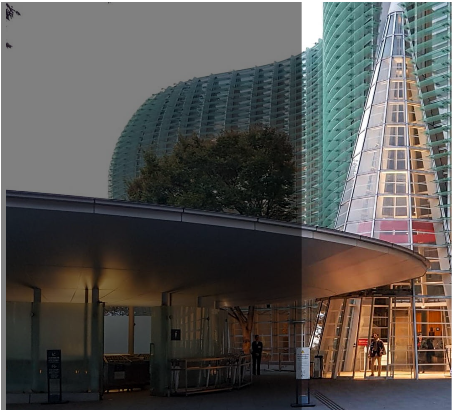
Art space in Tokyo

The Independent Administrative Institution National Museum of Art is the core of 5 art institutions. The National Art Center, Tokyo (NACT) is one of them. This enormous facility presents art exhibitions, art activities, and a library. Exhibitions are organised by NACT or co-organised with other institutions.