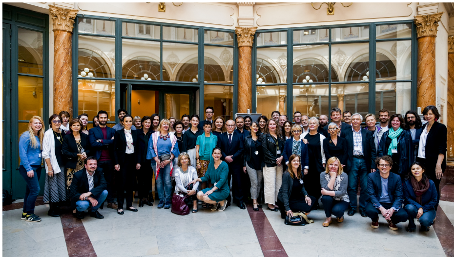
Assembly group picture at the Institut national d'histoire de l'art in Paris, France