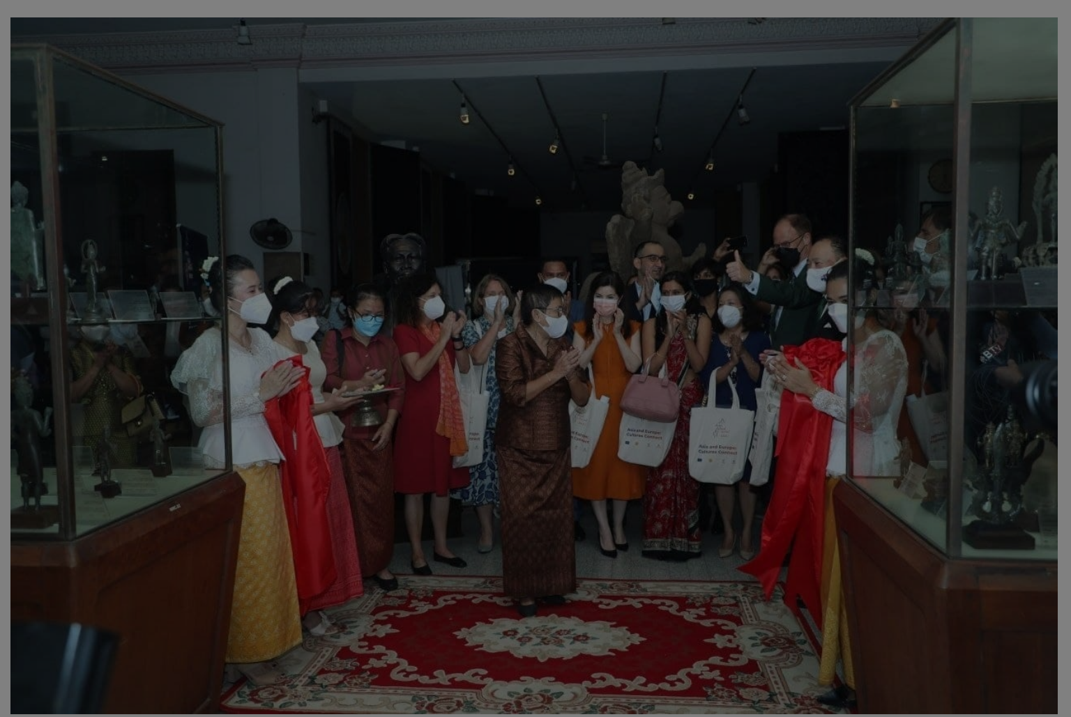
Her Excellency Dr Phoeurng Sackona, Minister of Culture and Fine Arts of Cambodia, at the opening of the ASEM Cultural Festival 2021 exhibitions at the National Museum of Cambodia.

hybrid model, we were able to garner much more ardent participation from international artists and present their artistic works to the best of our abilities, despite them being unable to join us on-site in Phnom Penh.