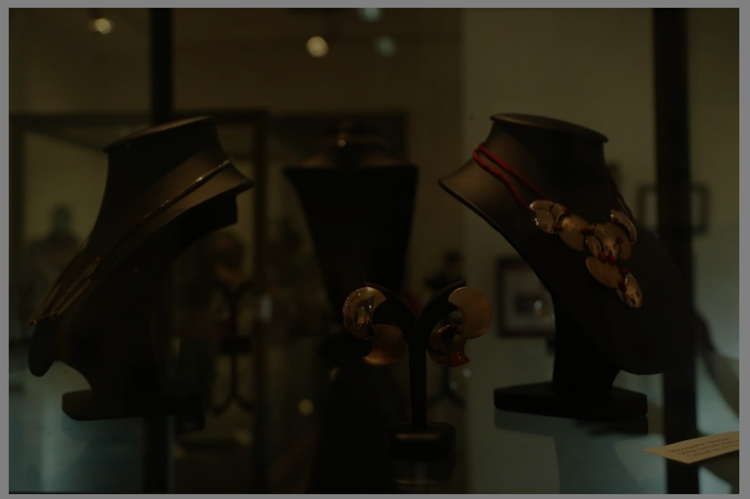
'Il Nodo: A Sketch for Hope' exhibition presented a collection of handcrafted jewellery produced collaboratively by Cambodian and Italian artists. (c) Ministry of Culture and Fine Arts, Cambodia

Artists and cultural professionals play very important roles in Asia-Europe relations, as they are the ones facilitating people-to-people connections from the ground up. With the pandemic, many global networks were adversely impacted, and a lack of cultural understanding only leads to less cohesion. This is where artists and cultural professionals are crucial members of our society - as they are the ones bridging bonds through various artforms and depictions of culture in a palatable way. People have always been dependent on the arts and culture sectors for recreation and entertainment, and opportunities to host an arts festival like this are excellent starting points to establish a deeper appreciation and understanding between the two regions.