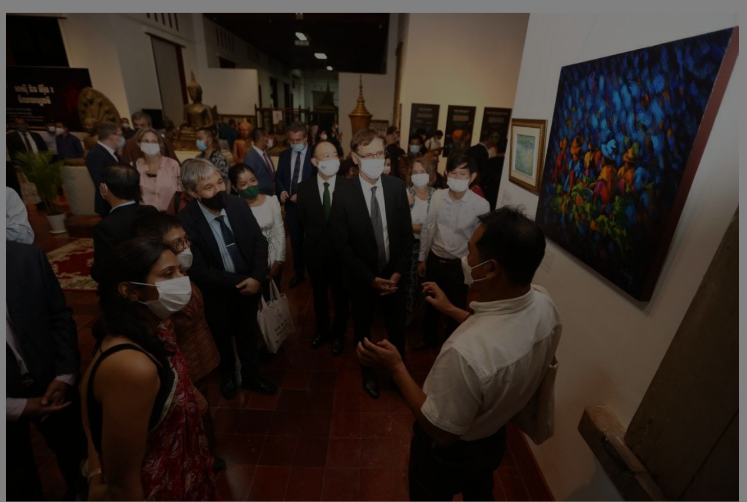
Audience listening ardently to the artist during the opening of the ASEM Cultural Festival 2021 exhibitions at the National Museum of Cambodia.

Along with the exhibitions, several film screenings were organised in Phnom Penh as part of the Festival. What kind of response have you received from audiences in Cambodia?