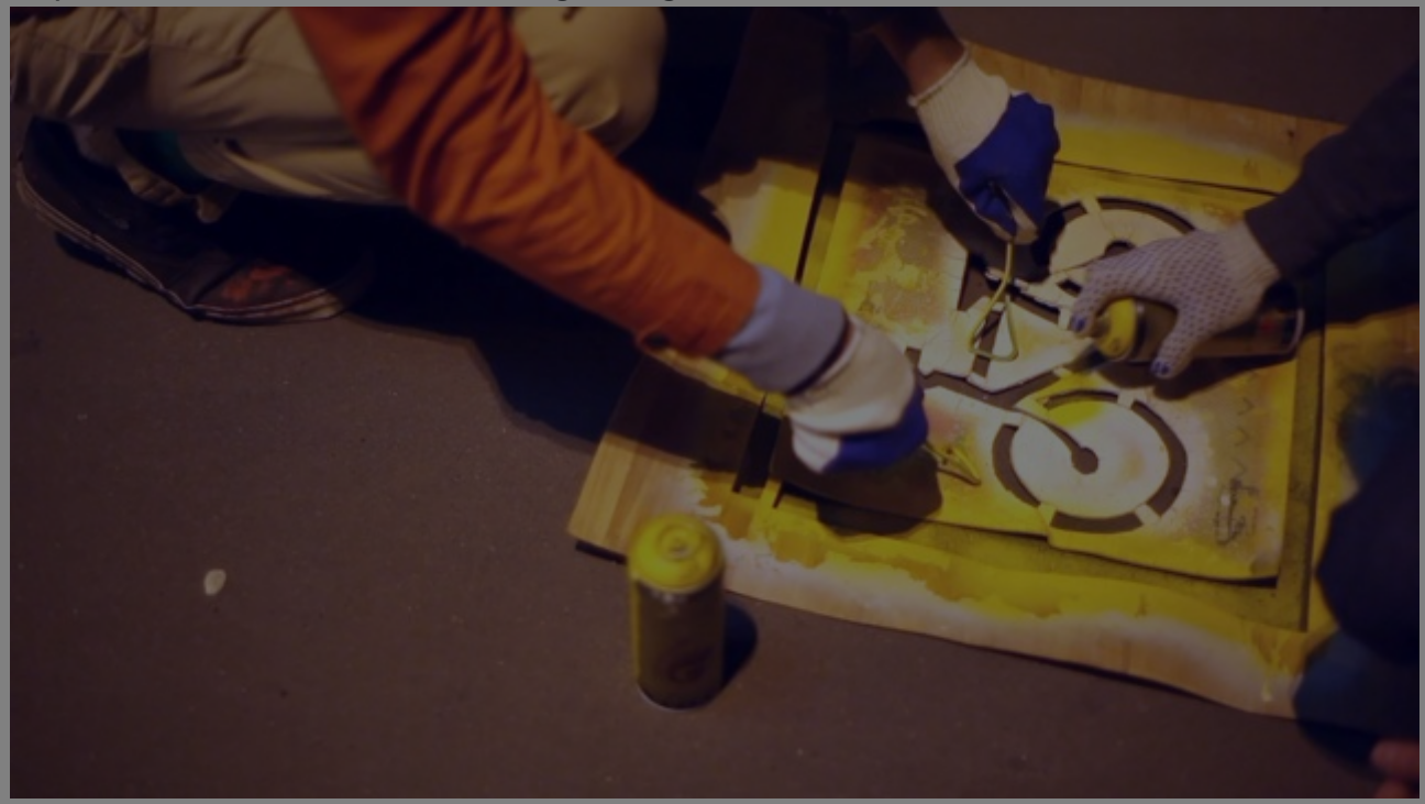
Partizaning - creating bike lanes in the city[/caption]

[caption id="attachment_57030" align="aligncenter" width="640"]