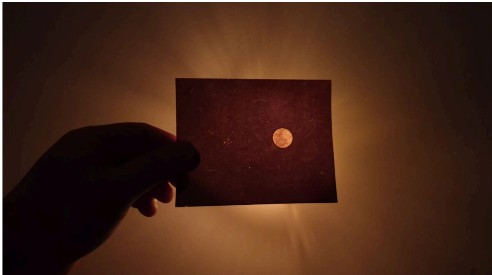
Photographed: Celine Lee's Borrowed Light

"The overall idea of this venture is that portability allows for exhibitions to exist pretty much anywhere," explains Quinto in an interview.