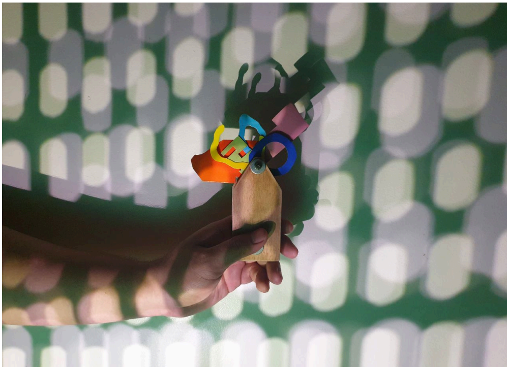
Photographed: Miguel Puyat's Portable Collage Maker

Experiencing art during the pandemic has become impersonal with the absence of physical space to navigate. Parcel Exhibitions, through portable artworks , presents an alternative way of exhibiting within the confines of your own space, allowing an intimate engagement, whether in private or as part of a small group.