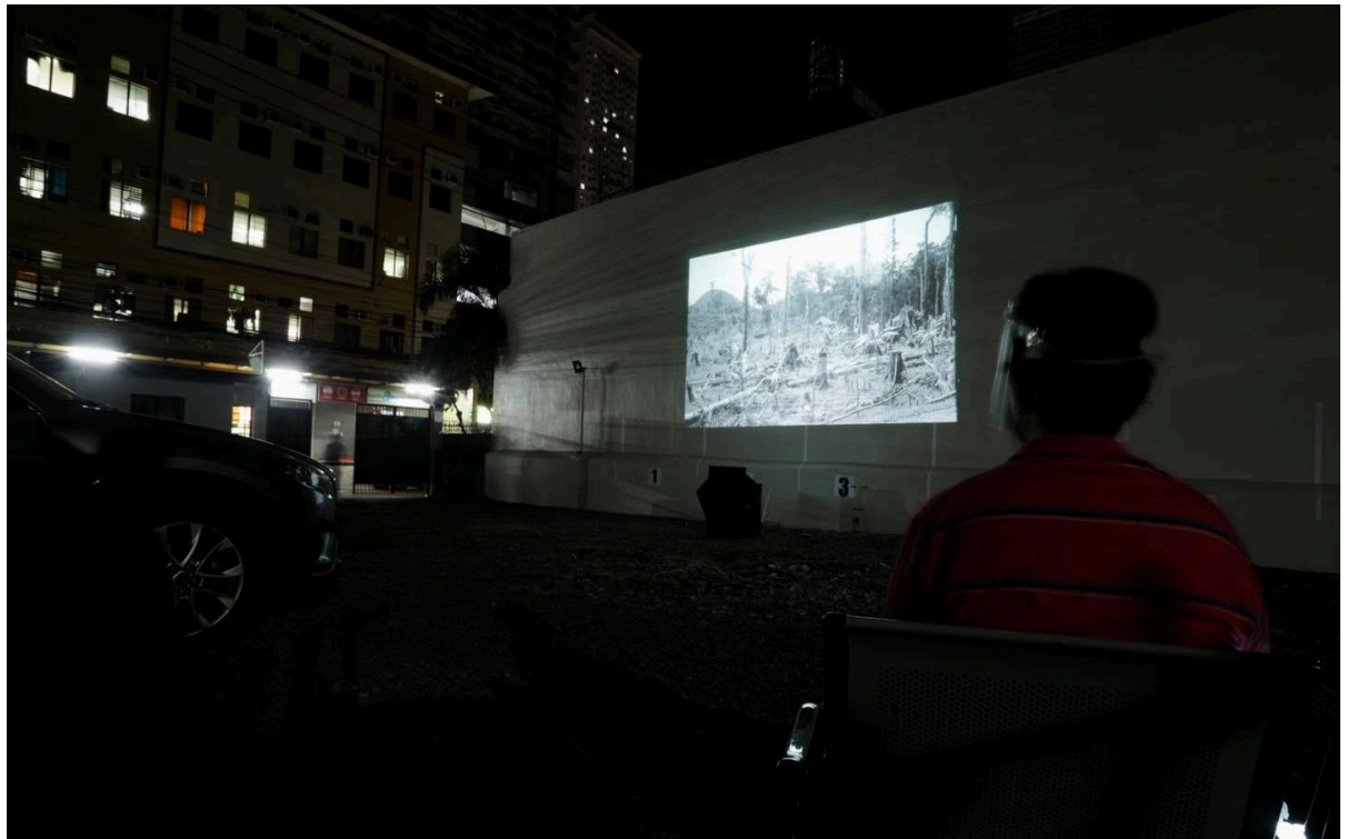
MCAD's drive-in theater for Watch and Chill