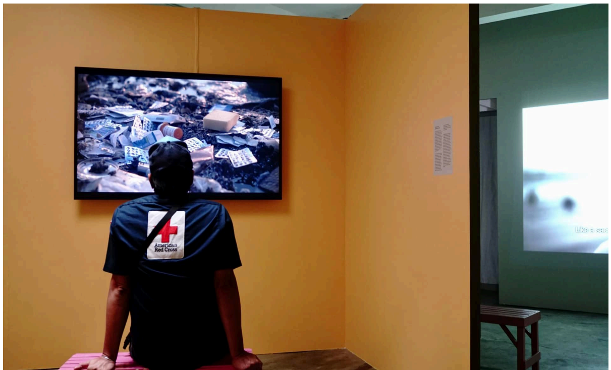
MCAD Commons: AFI Care on-site video installation in Lucban, Quezon;