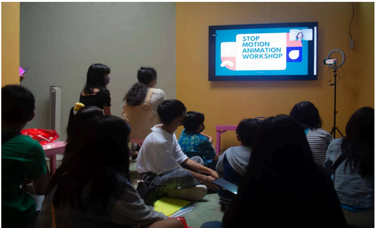
Collage animation workshop as part of the public program for MCAD Commons: AFI Care; Image courtesy of Facebook/ProjectSpacePilipinas

Artists’ Film International (AFI), an initiative project of Whitechapel Gallery , gathers video works from the collection of more than 20 partner institutions around the globe. Touching on the theme “care”, AFI 2021 features the work of Filipina artist Kiri Dalena who has been selected to participate in Documenta 15.