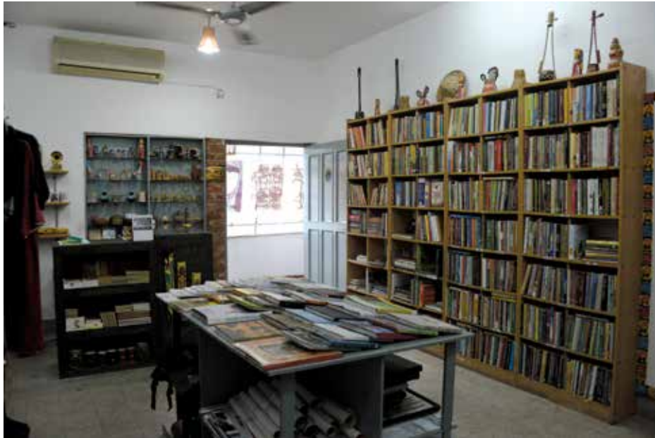
Started in 2014, it was sponsored through a successful crowd funding campaign