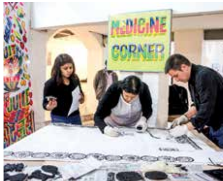
The three-day festival comprises panel discussions, workshops, labs, performances, exhibitions, community meals and excursions into the city of Delhi

Attempts were also made to align these various expectations with the vision of the Festival. Integral to this process was identifying complimentary and opposing needs, and key to this alignment was the financial sustainability.