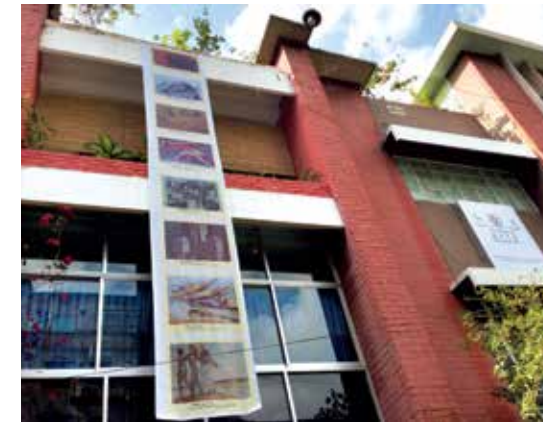
Home for exhibitions, multimedia presentations, talks, dance and music performances, and festivals

Though Chittagong is the second biggest city in Bangladesh it is still far smaller with a population of 2.6 million against the capital Dhaka's 6.7 million (as per the census of 2011). This balance is also reflected in their respective culture budgets. "While discussing the annual budgets allocated for cultural activities by the Government, my friend, the Director of the National Museum, Dhaka, informed me that only 5-10%