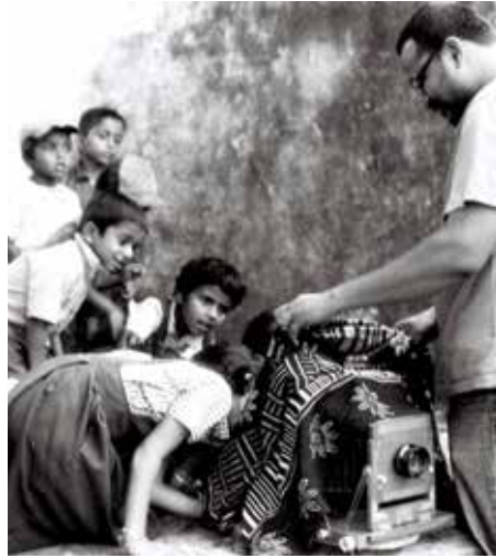
Black and white photography workshops are some of the activities of Goa-CAP annual programme

to generate new ideas, research and scholarship in photography that will best serve an artist who must operate in an international framework of sectoral knowledge. To this effect, the organisation invited artists, scholars, and key cultural figures to work, exhibit, teach and present at the Centre. Goa-CAP created a robust annual programme of activity spanning the breadth and depth of scholarship and research in alternative photography that included pinhole photography workshops, contests, black and white photography workshops, talks, archival projects, a public library for photography, residencies, and a community darkroom. The target group comprised both professional and amateur photographers, along with visual artists, filmmakers, writers and performers who are interested in exploring and experimenting with photography as a medium.