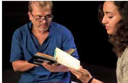
Play reading at Ringan, a series of monthly literature-based activities

Indian theatre is performed in 24 major languages and around 50 folk theatre forms. 5,6 With this kind of diversity of languages, it is highly likely that an Indian may not be able to decipher the language of a neighbouring state. The 2 main spoken languages in India with official status are Hindi (at 551.4 million) and English (at 125 million). 7,8 Any theatre work created outside these 2 languages will typically be accessed only by those who primarily speak that language or live in that region. Marathi is spoken by nearly 73 million people in India, 9 a figure that has been declining steadily mainly due to migration of other language speakers to the state of Maharashtra. 10 These dynamics do impact the numbers of audience for Marathi theatre. Moreover, between the urban and the rural, Maharashtra has a rich tradition of popular musical theatre, commercial theatre and folk theatre (tamasha), which continue to draw huge audiences. As Ashish MEHTA, Administrative Head at Aasakta