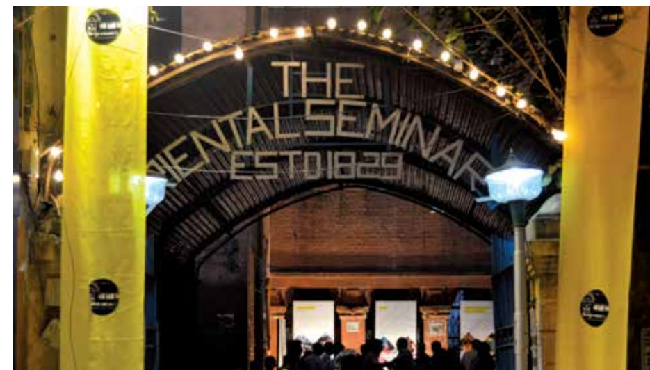
The Oriental Seminary School is the earliest privately-run school in Kolkata