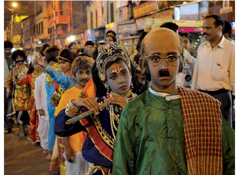
Chitpur Local creates dialogue among the community using art, design and historical revivals