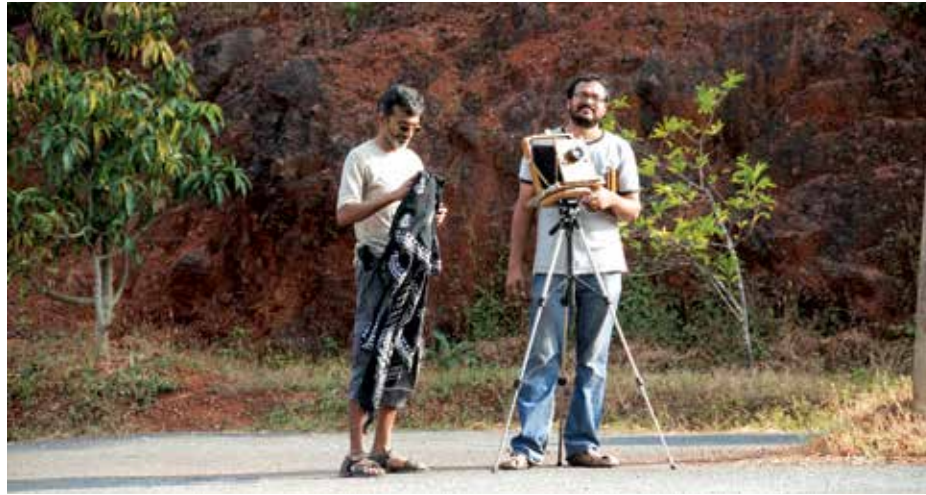
Goa-CAP activities are open to professional and amateur photographers

helped them ration the budget in ways that would maximise value for every penny spent on the project.