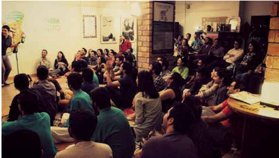
Hundreds of events, ranging from poetry readings and film screenings are hosted at T2F space

T2F has also held events related to the military that drew both warnings from well-wishers and visits from security agencies. Once such event, in 2007, was a talk by author Ayesha SIDDIQA on her book Military Inc. , a report on Pakistan's military institution. As per media news, other controversial events included a film on the country's missing people. 42 Sabeen was aware of the risks she was taking: "I stand up for what I believe in. But I can't fight guns. I know that much, and nothing is worth dying for", she said in an interview 43 in 2010. She further states: "We are talking about its [the blasphemy law's] repeal. It is important to talk about this. Those kinds of risks we are happy to take. More people need to stand up." The balance of Sabeen's position of standing up against all odds and yet being conscious of its risks, didn't always pan out as planned. "All her feeds were set to public visibility – her posts, tweets, settings. She had