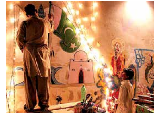
PeaceNiche, creates inclusive, inspirational spaces for open debate and cultural exchange

art out of the galleries and onto the streets. This was also an attempt to bring some of T2F’s activities to the people in T2F’s galli (alley) so that