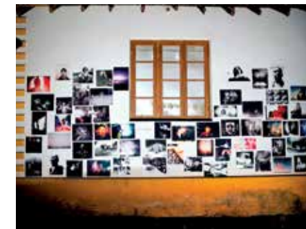
The organisation runs ALTab, a 2-month residency for Indian artists that focuses exclusively on alternative photography