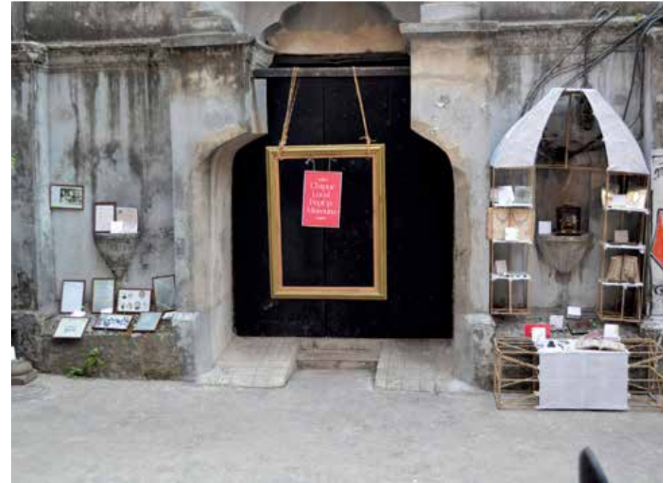
Hamdasti uses art and design to create interactions, dialogue and social engagement