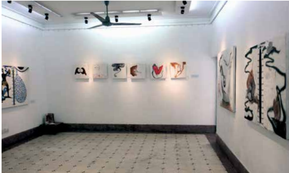
BCAC is a multidisciplinary arts facility

Historically, the city's culture was transformed by its varied encounters with traders, mystical Islamic Sufi saints, Hindu intellectuals and Buddhist monks. Once a flourishing centre of medieval Bengali literature, Chittagong continues to impact cultural production in Bangladesh. Chittagong is regarded as the "birthplace of Bangladeshi band music scene", and boasts of a vibrant contemporary visual and performing arts scene.