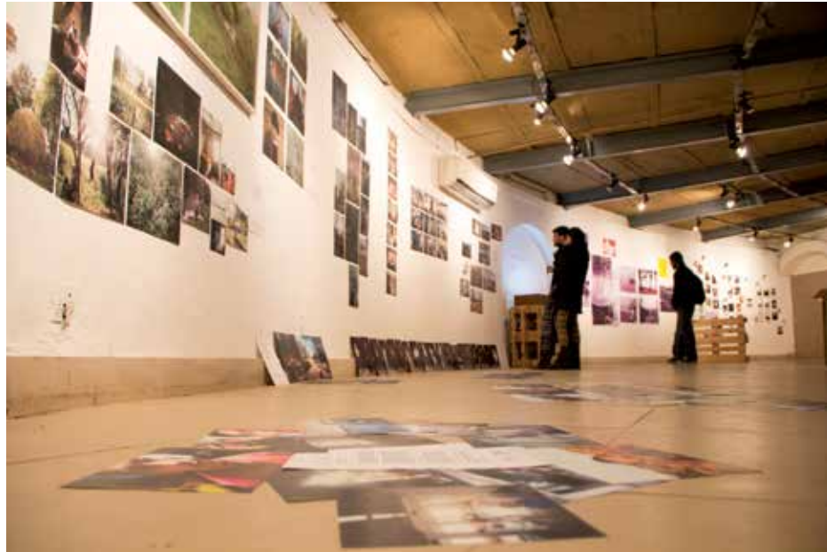
The Festival runs a crowd-sourced content project where participants become co-creators