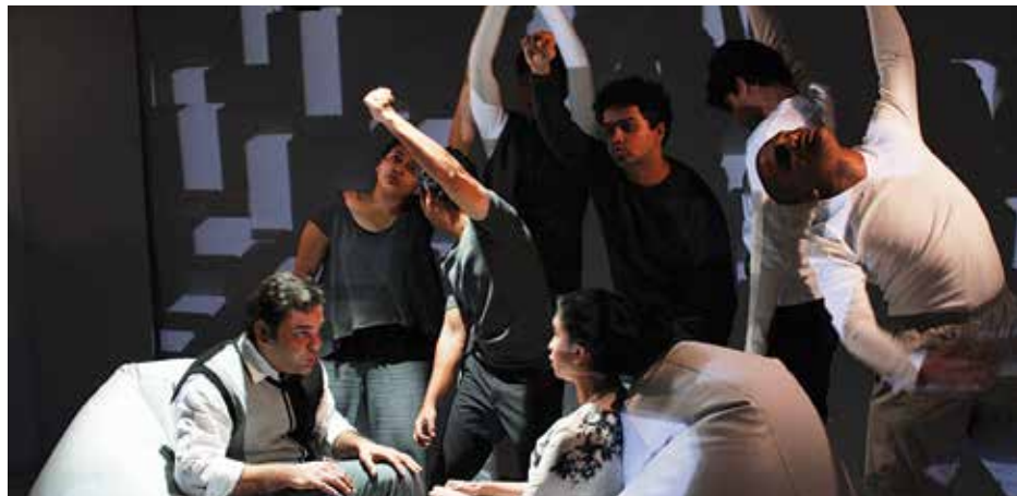
Aasakta production “Flat Number F-1/105” by director Mohit TAKALKAR

text to be translated in 13 languages, which garnered a great response. With availability of translated plays, a movement of inter-regional language plays gathered momentum – initially under SNA, and later independently”. 11 Such initiatives allowed for crossing of language barriers at the time. Today, such initiatives are far and few in between.