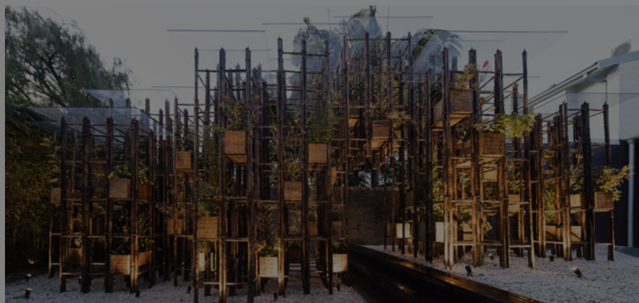
Vo Trong Nghia Architects, 'Green Ladder', 2016, bamboo poles, wooden pots in bamboo matting, flora,