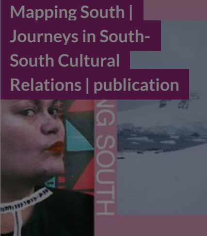
POSTED ON 16 FEB 2023