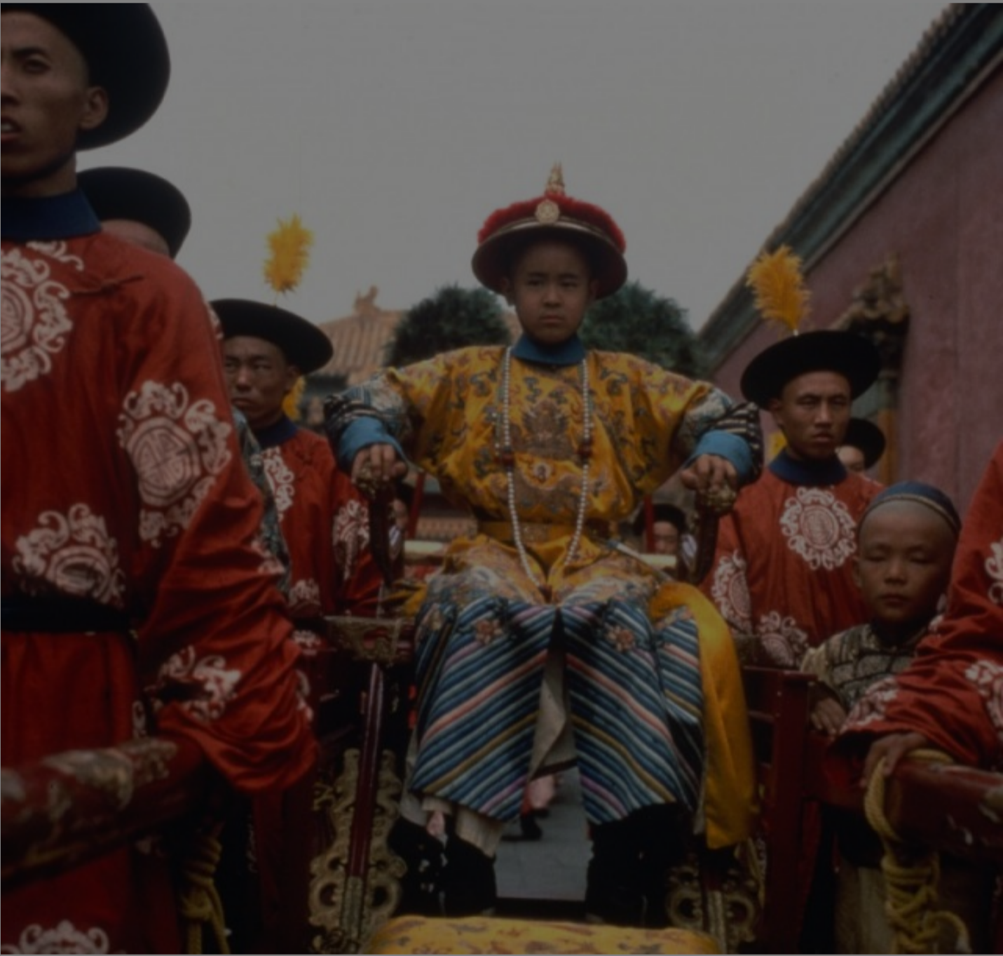
[caption id="attachment_6942" align="alignleft" width="298" caption="Image of Adrienne Corri from The River (1951) by Jean Renoir."]