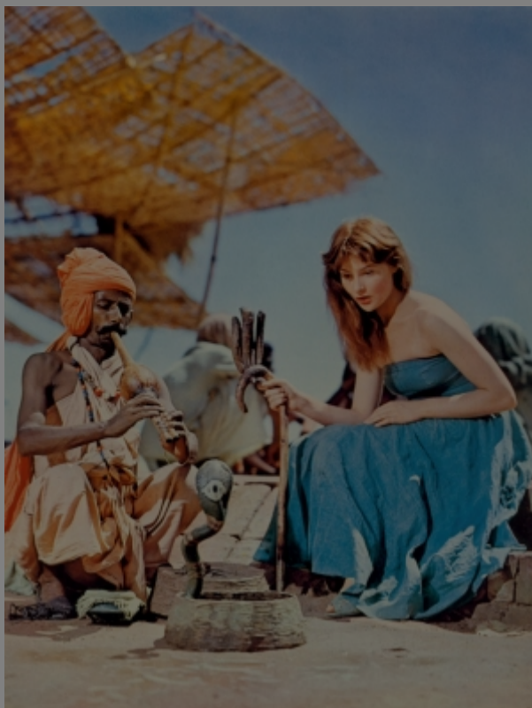
[/caption] The Asia-Europe Foundation (ASEF) , in