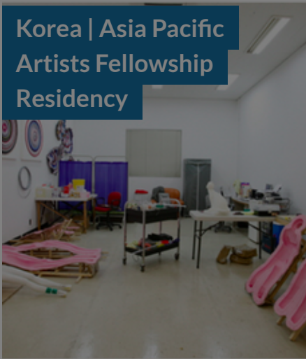
Korea | Asia Pacific Artists Fellowship Residency