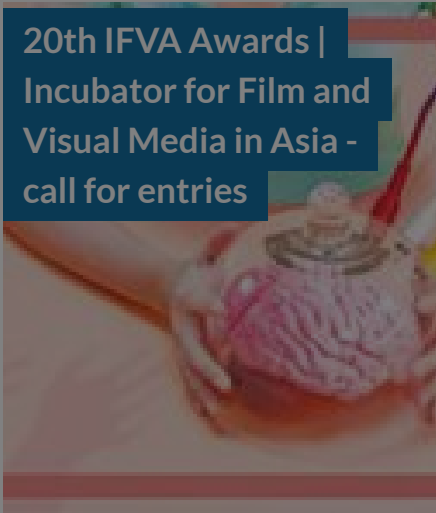
20th IFVA Awards | Incubator for Film and Visual Media in Asia - call for entries