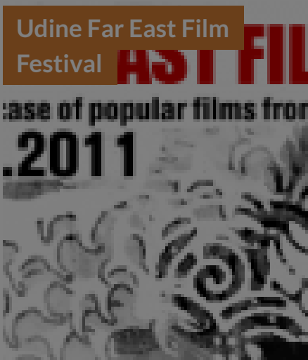
Udine Far East Film Festival