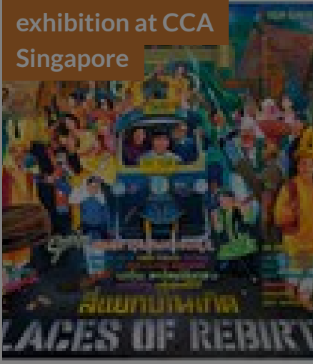
exhibition at CCA Singapore